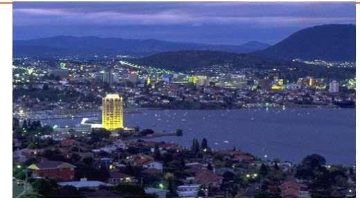
HOBART is the capital of Tasmania.