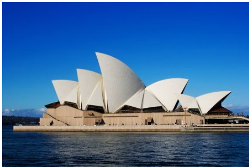
The biggest cities in Australia is SYDNEY, the capital of New South Wales. It is a big multicultural city. This is the famous opera house.