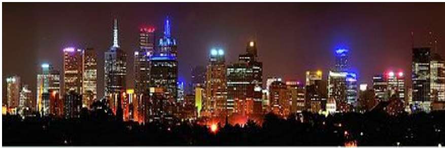
MELBOURNE is the capital of Victoria.