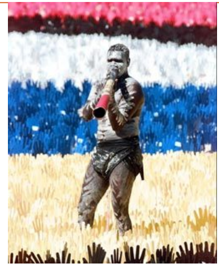
He is playing the DIDGERIDOO

The aboriginal culture represents nature. They have a traditional instrument called the didgeridoo.