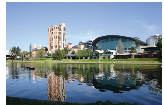
ADELAIDE is the capital of South Australia.