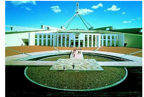
CANBERRA is the capital of Australia. This is Parliament House.