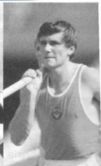
Sergey Bubka athletics 1980