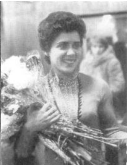
Irina Rodnina figure skating 1972