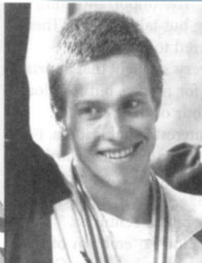
Vladimir Salnikov swimming 1988