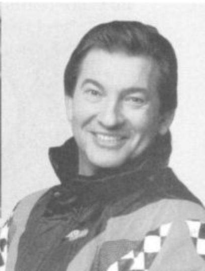
Vladislav Tretyak ice hockey 1976