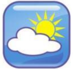
Sunny and cloudy