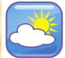
Sunny and cloudy