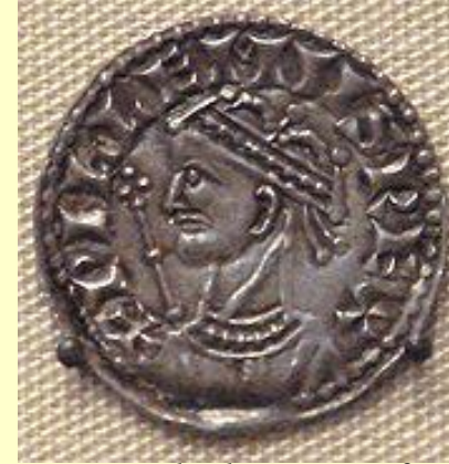
•English coin of William the Conqueror (1066–1087)

Although the south of England submitted quickly to Norman rule, resistance in the north continued for six more years until 1072. During the first two years, King William I suffered many revolts throughout England and Wales. In 1072, he invaded Scotland, defeating Malcolm, who had recently invaded the north of England.