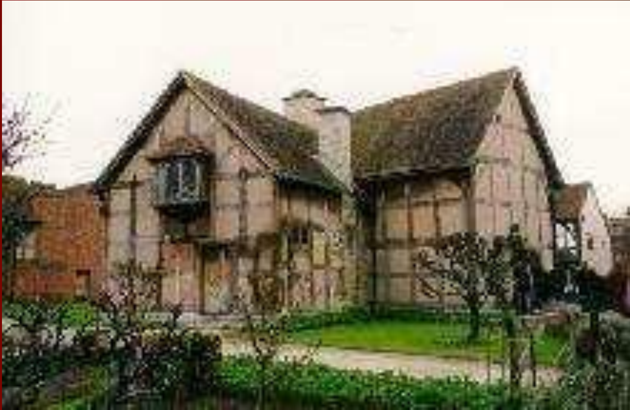
Stratford - on - Avon