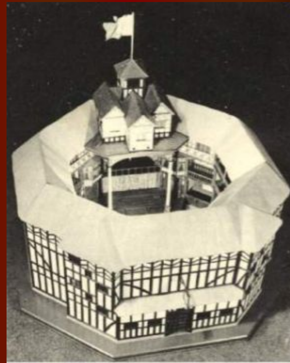
Top view of Shakespeare's Globe Theater