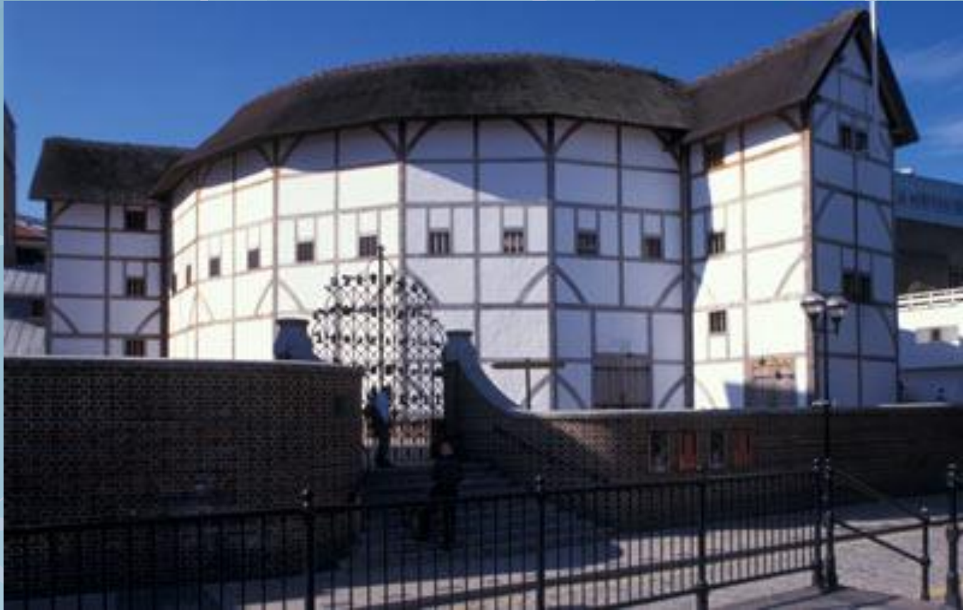
New Globe theatre.