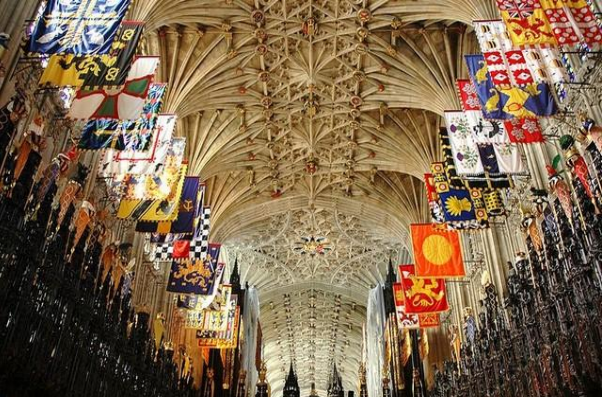
The interior of a medieval chapel of St. George