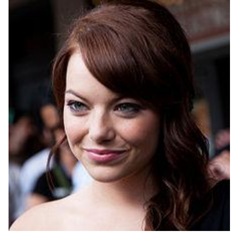
Emma Stone as Wichita