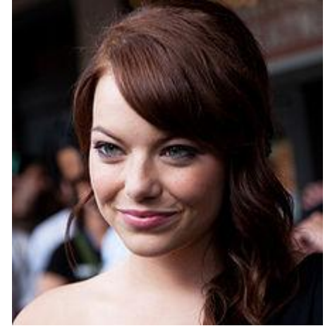
Emma Stone as Wichita