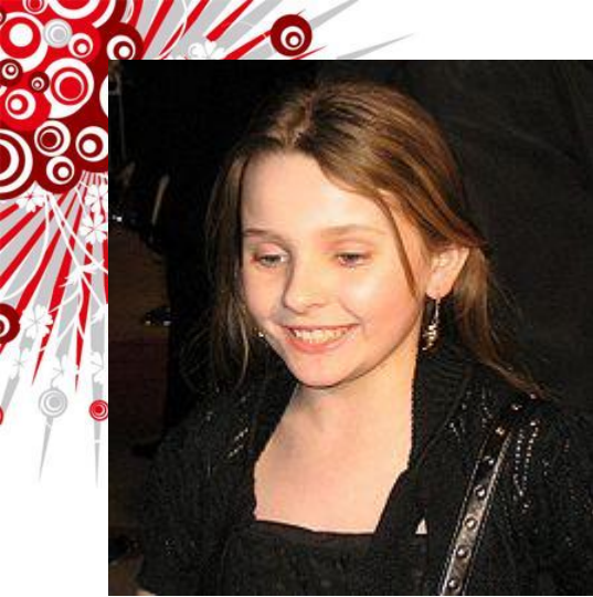
Abigail Breslin as Little Rock