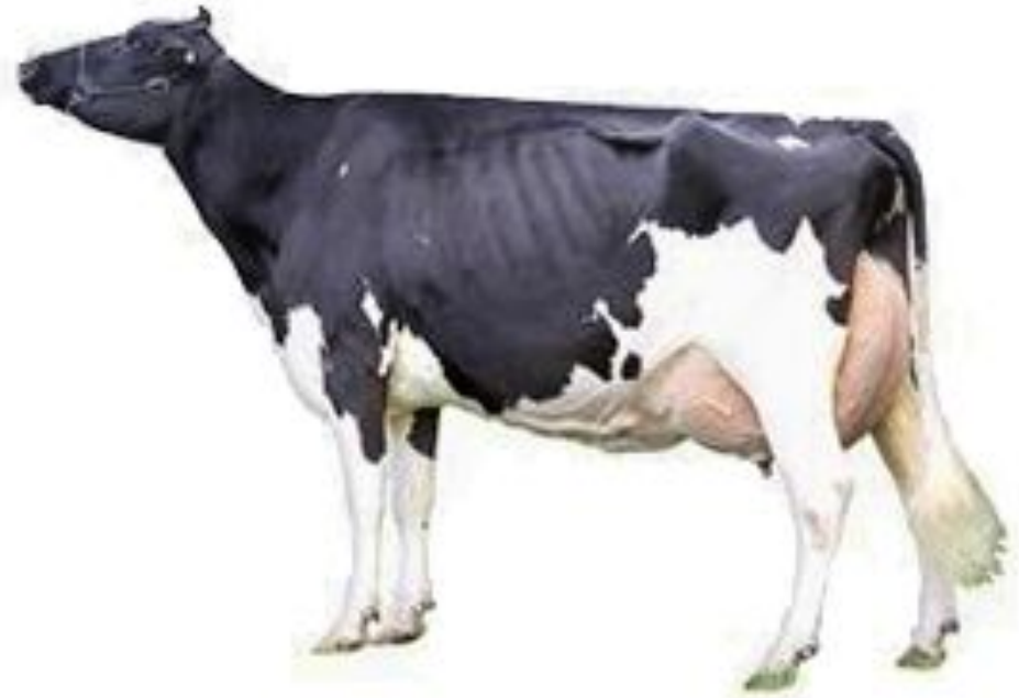
Domesticated Dairy Cow