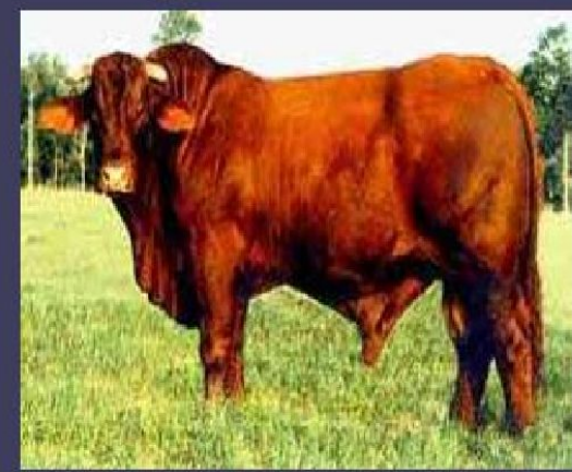
Santa Gertrudis cattle (cross of 2 breeds)