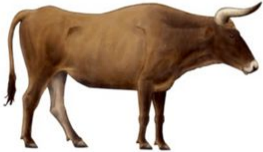
Auroch (Wild cow: ancestor of all domesticated cattle)