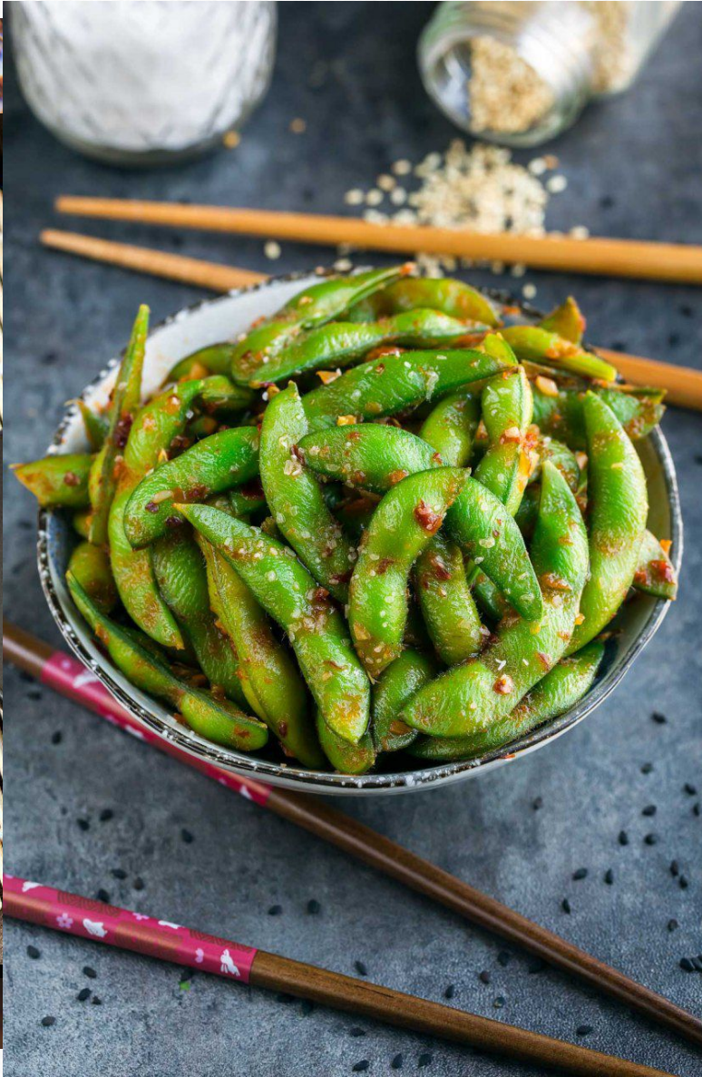
Edamame – 500000 sum