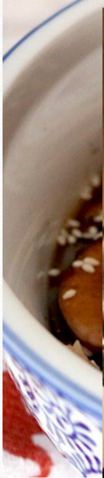
White vegetarian ramen – 20000 sum