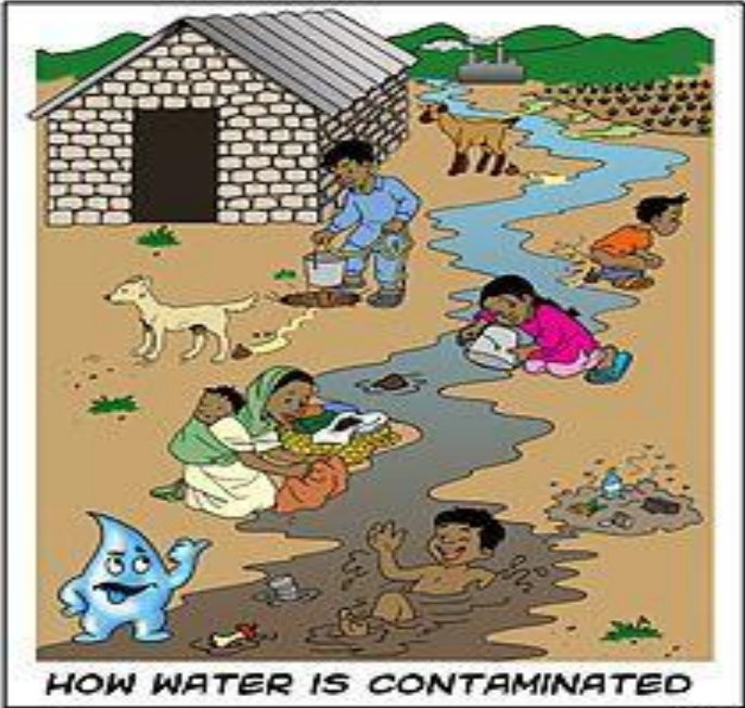
HOW WATER IS CONTAMINATED