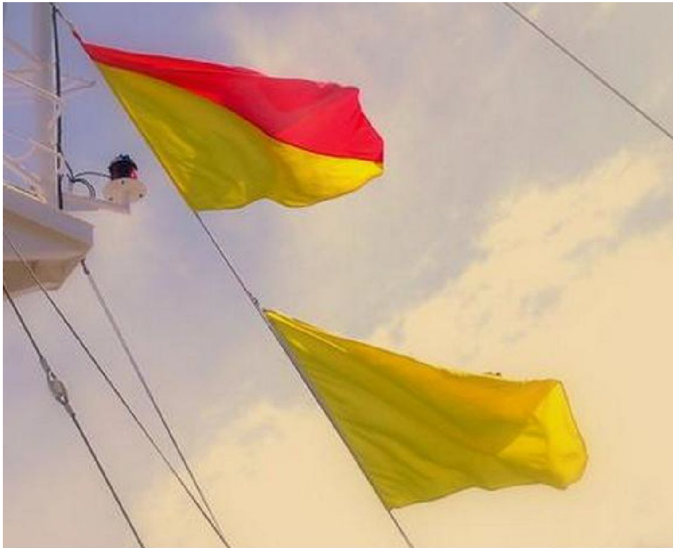
Signal flags "OSCAR" over "QUEBEC" - Denotes swinging the ship