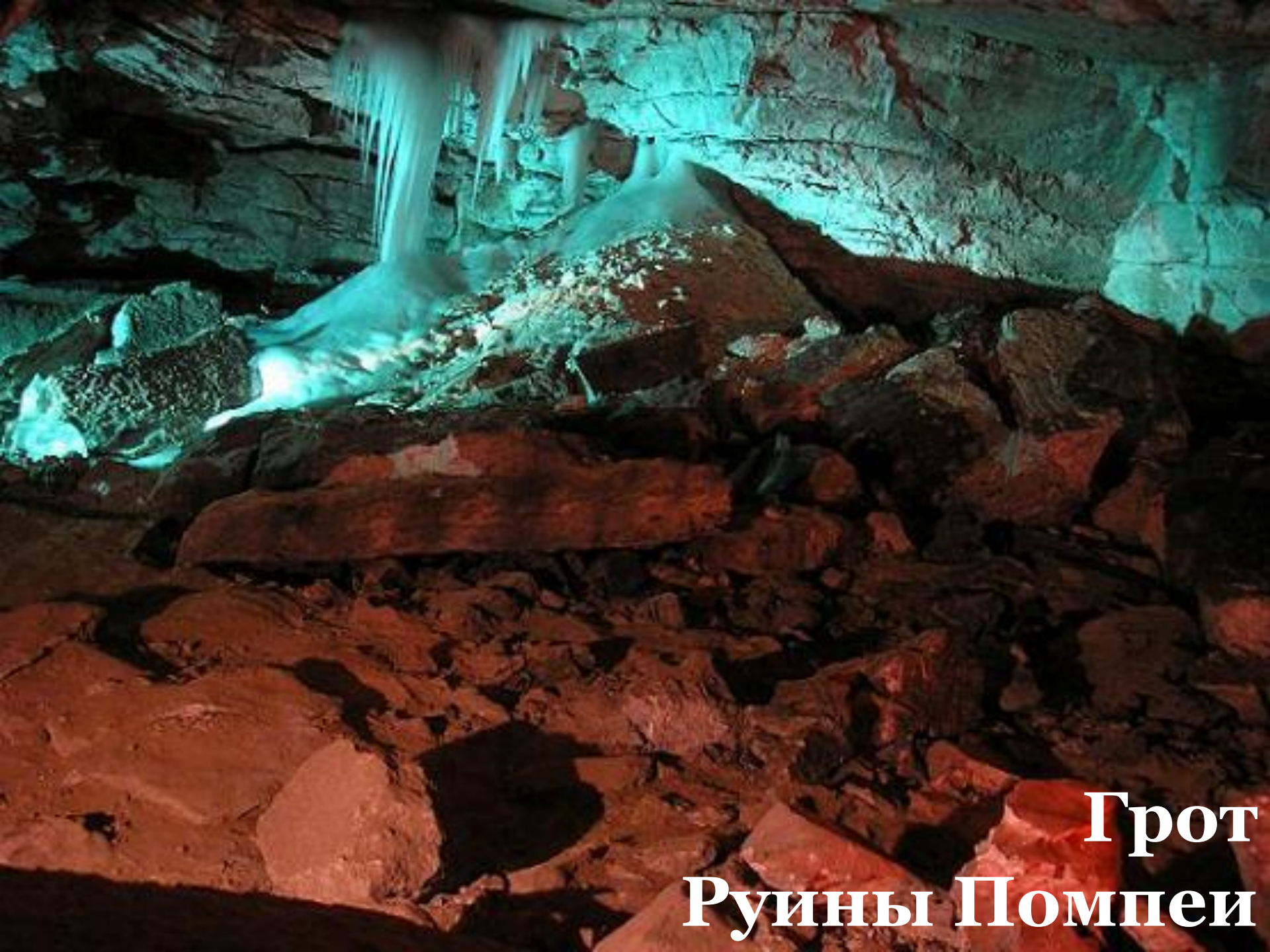
Грот Руины Помпеи