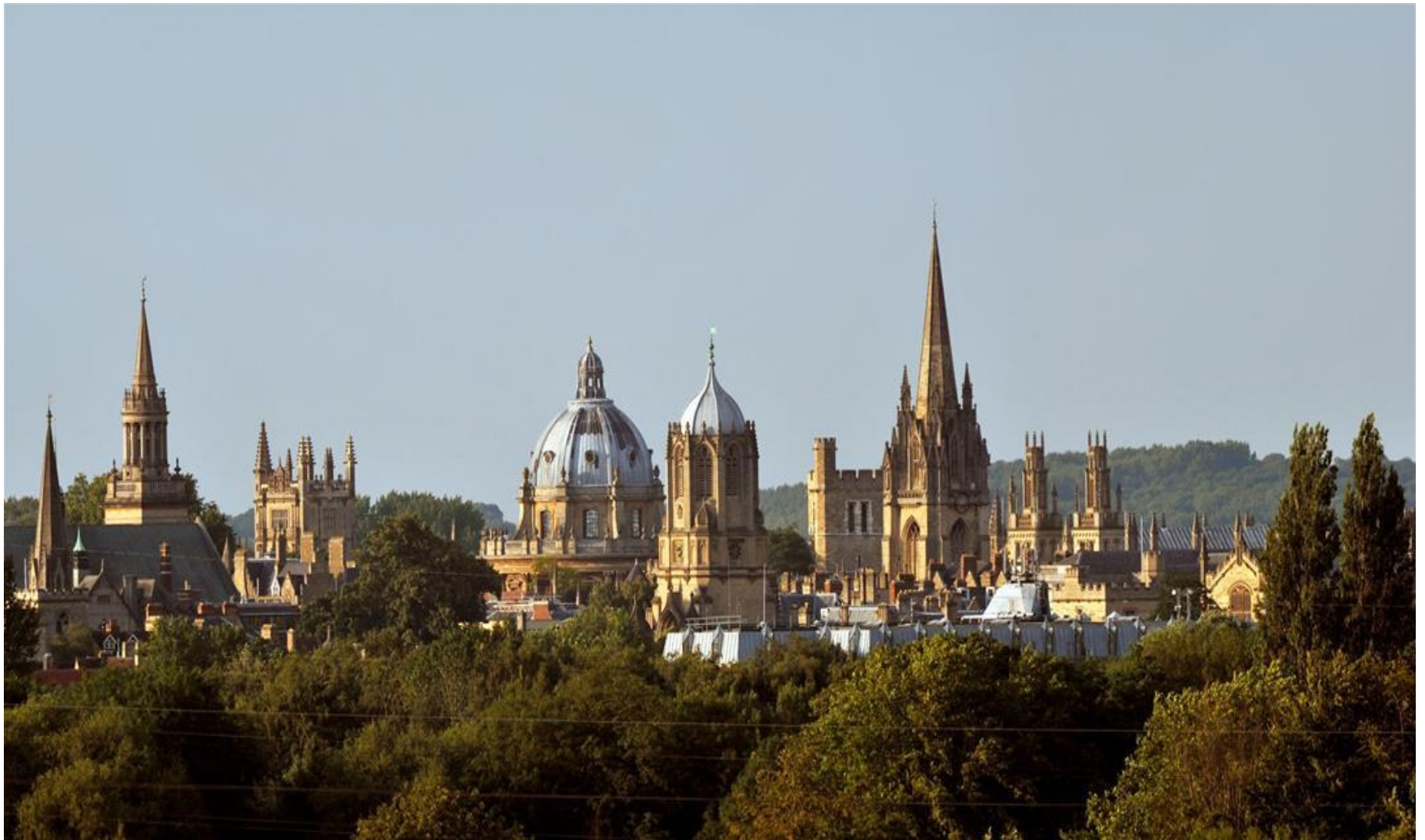
Oxford's “dreaming spires”