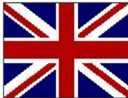
Union Jack (since 1801)