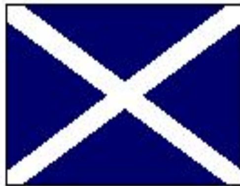
Cross of St. Andrew (Scotland)