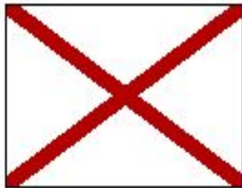
Cross of St. Patrick (Ireland)