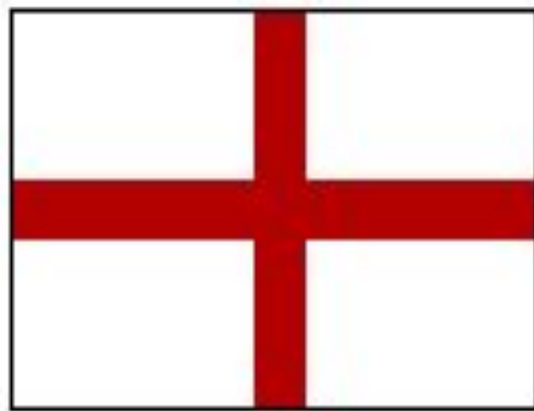
Cross of St. George (England)