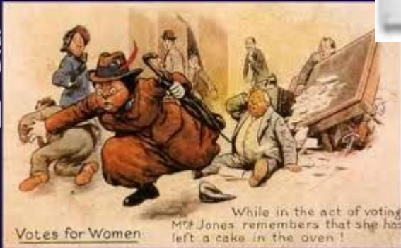
Votes for Women