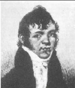
Juan José de Elhuyar Discoverer of Tungsten