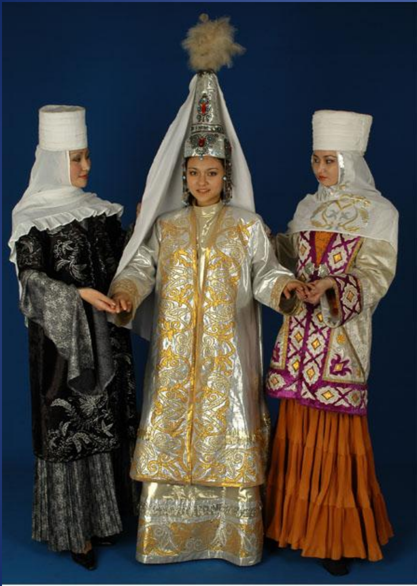
National clothes of Kazakh women