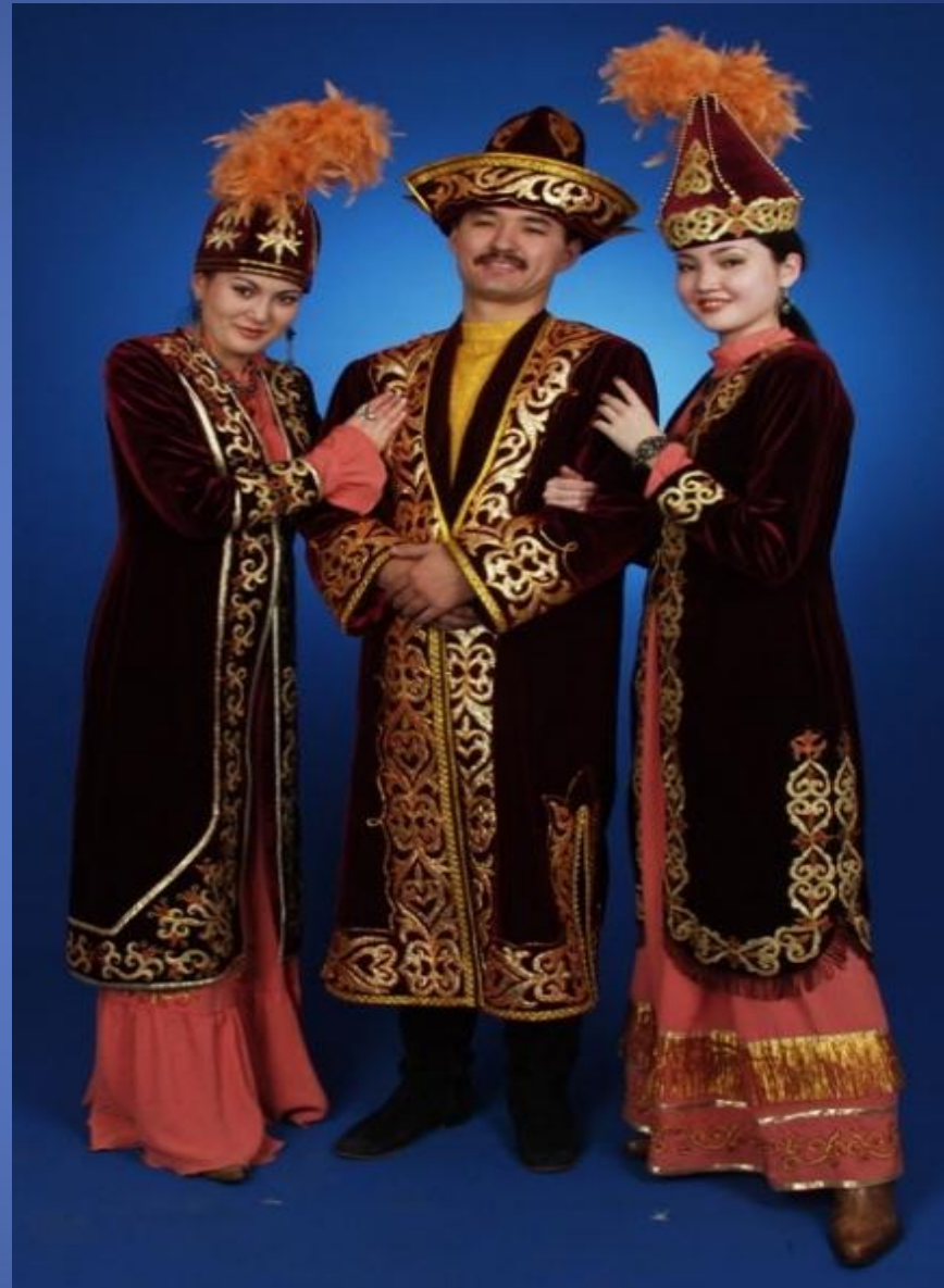
National clothes of Kazakh men