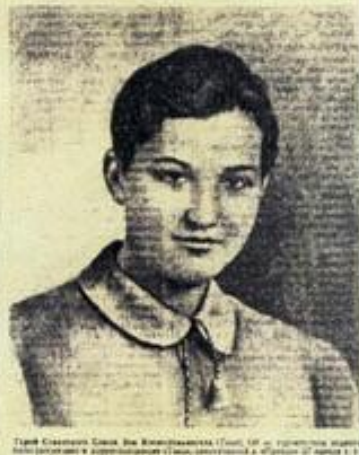
Герой Советского Союза Зоя Александровна Космодемьянская. 17 лет от роду она вступила в партизанский отряд и героически сражалась с врагом.

The story of Zoya Kosmodemyanskaya became popular after Pravda published an article written by Pyotr Lidov on January 27, 1942. The journalist had heard about Zoya's execution from an elderly peasant, and was impressed by the young woman's courage. The witness recounted: "They were hanging her and she was giving a speech. They were hanging her and she was threatening them." Lidov travelled to Petrishchevo, collected details from local residents and published an article about the then-unknown partisan girl. Soon after, Joseph Stalin noticed the article. He proclaimed: "Here is the people's heroine", which started a propaganda campaign honouring Kosmodemyanskaya. In February, she was identified and was awarded the order of Hero of the Soviet Union.