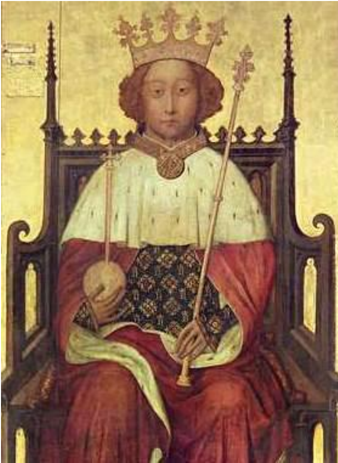
King Richard in youth