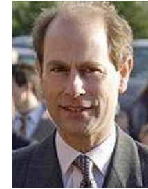
Edward, Earl of Essex Married to Sophie Rhys-Jones