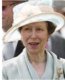
Anne, Princess Royal Formerly married to Mark Phillips