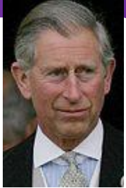
Charles, Prince of Wales Formerly married to Princess Diana