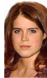
Princess Beatrice and Princess Eugenie of York