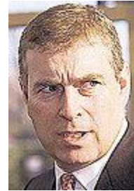
Andrew, Duke of York Formerly married to Sarah Ferguson