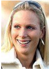
Peter Phillips and Zara Phillips