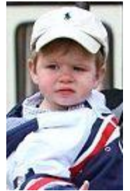
Lady Louise Windsor and James, Viscount Severns