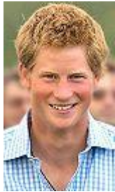
Prince William and Prince Harry of Wales