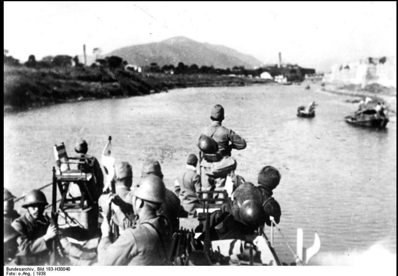
Bild 183-H30040 1938