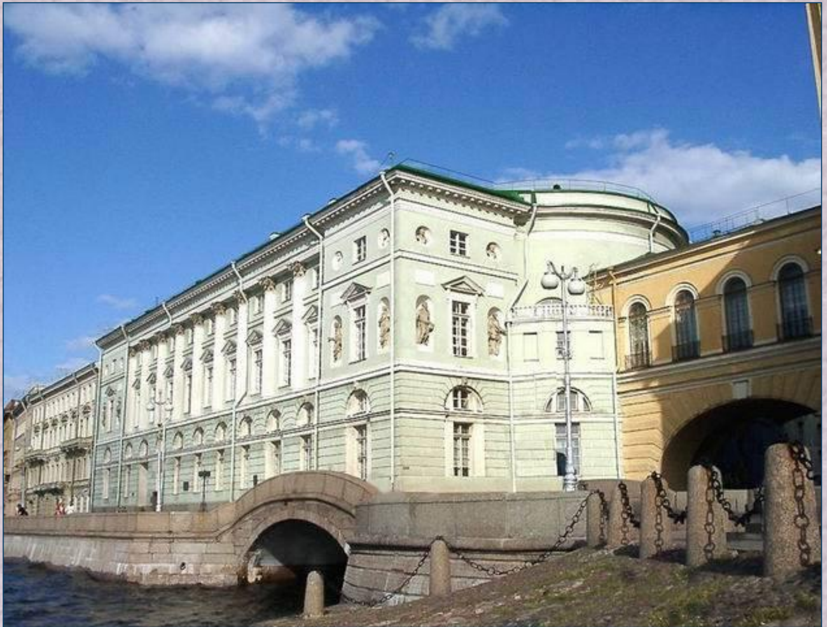
The Hermitage Theatre