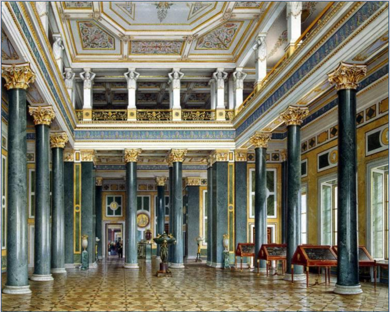
The Room Of Coins And Medals