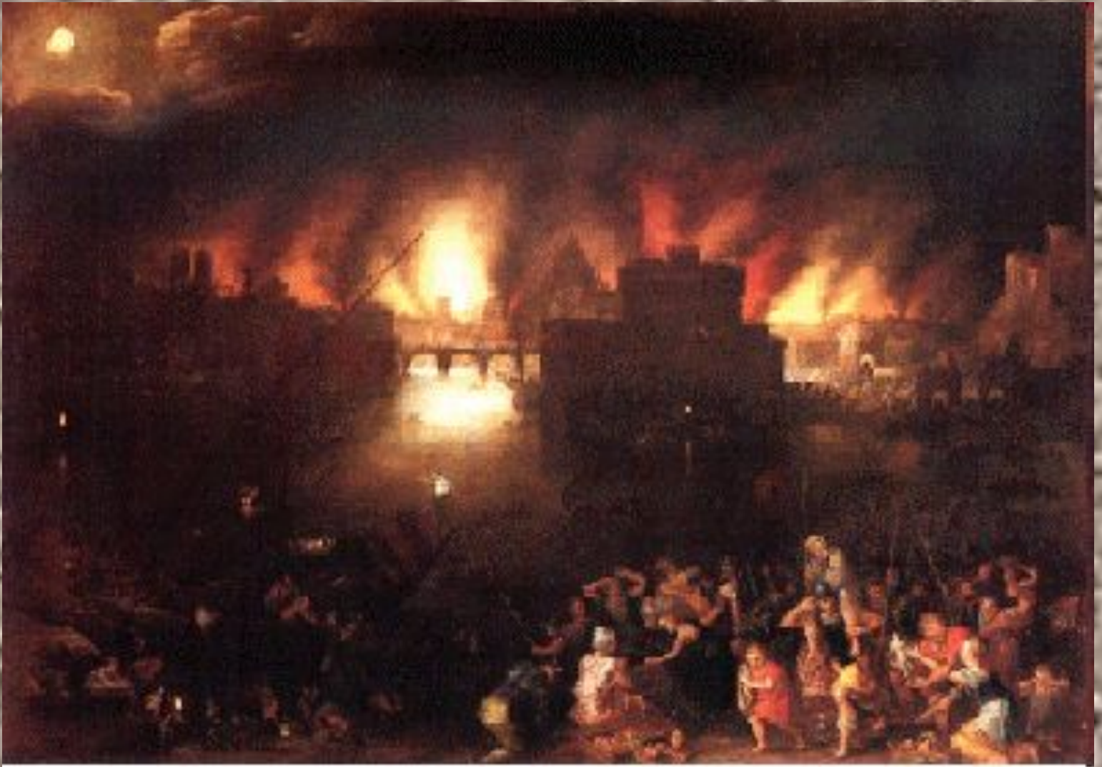
Brueghel, Jan the Elder. The Burning of Troy (c.1671-72)