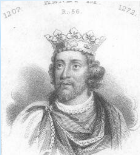
King Henry III

Henry III built a luxurious royal palace within the castle during the middle of the century, and Edward III went further, rebuilding the palace to make an even grander set of buildings in what would become "the most expensive secular building project of the entire Middle Ages in England". Edward's core design lasted through the Tudor period, during which Henry VIII and Elizabeth I made increasing use of the castle as a royal court and centre for diplomatic entertainment.