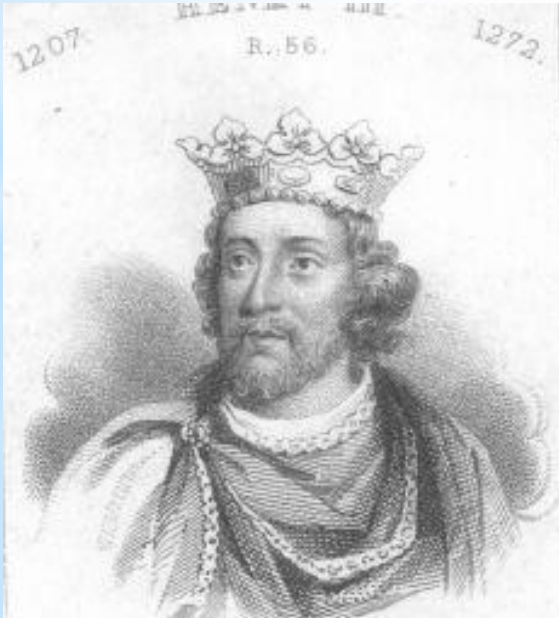
King Henry III

Henry III built a luxurious royal palace within the castle during the middle of the century, and Edward III went further, rebuilding the palace to make an even grander set of buildings in what would become "the most expensive secular building project of the entire Middle Ages in England". Edward's core design lasted through the Tudor period, during which Henry VIII and Elizabeth I made increasing use of the castle as a royal court and centre for diplomatic entertainment.