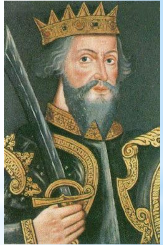
William the Conqueror. 1027 (28)- 1087