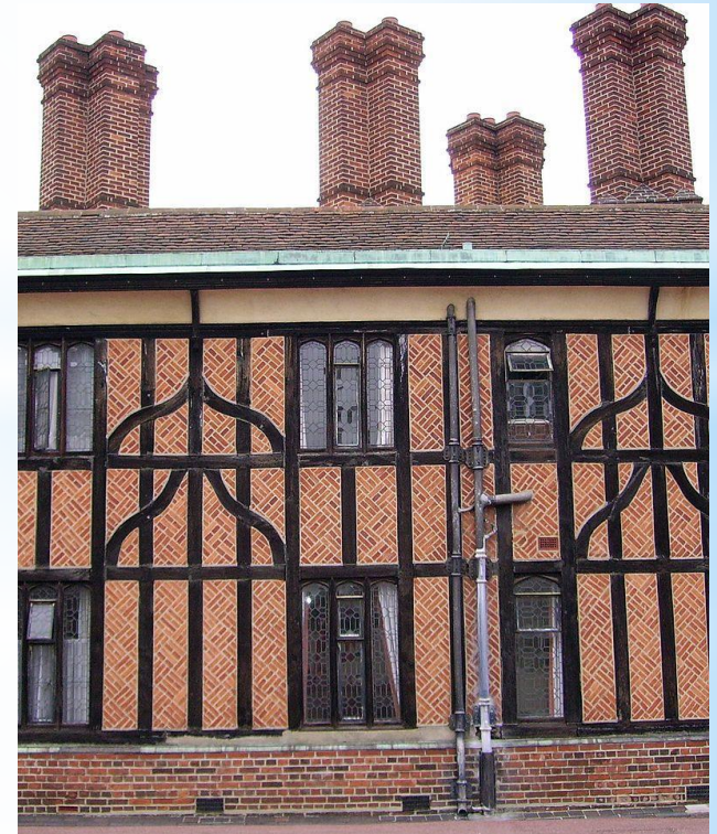
The Horseshoe Cloister, built in 1480 and reconstructed in the 19th century