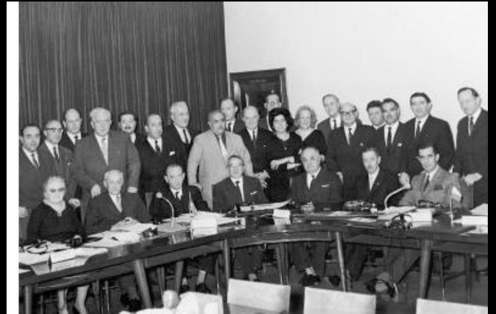
The first Organising Council - 1954