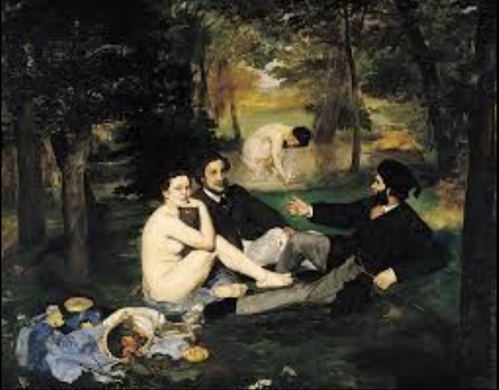
Manet, Luncheon on the Grass , 1863