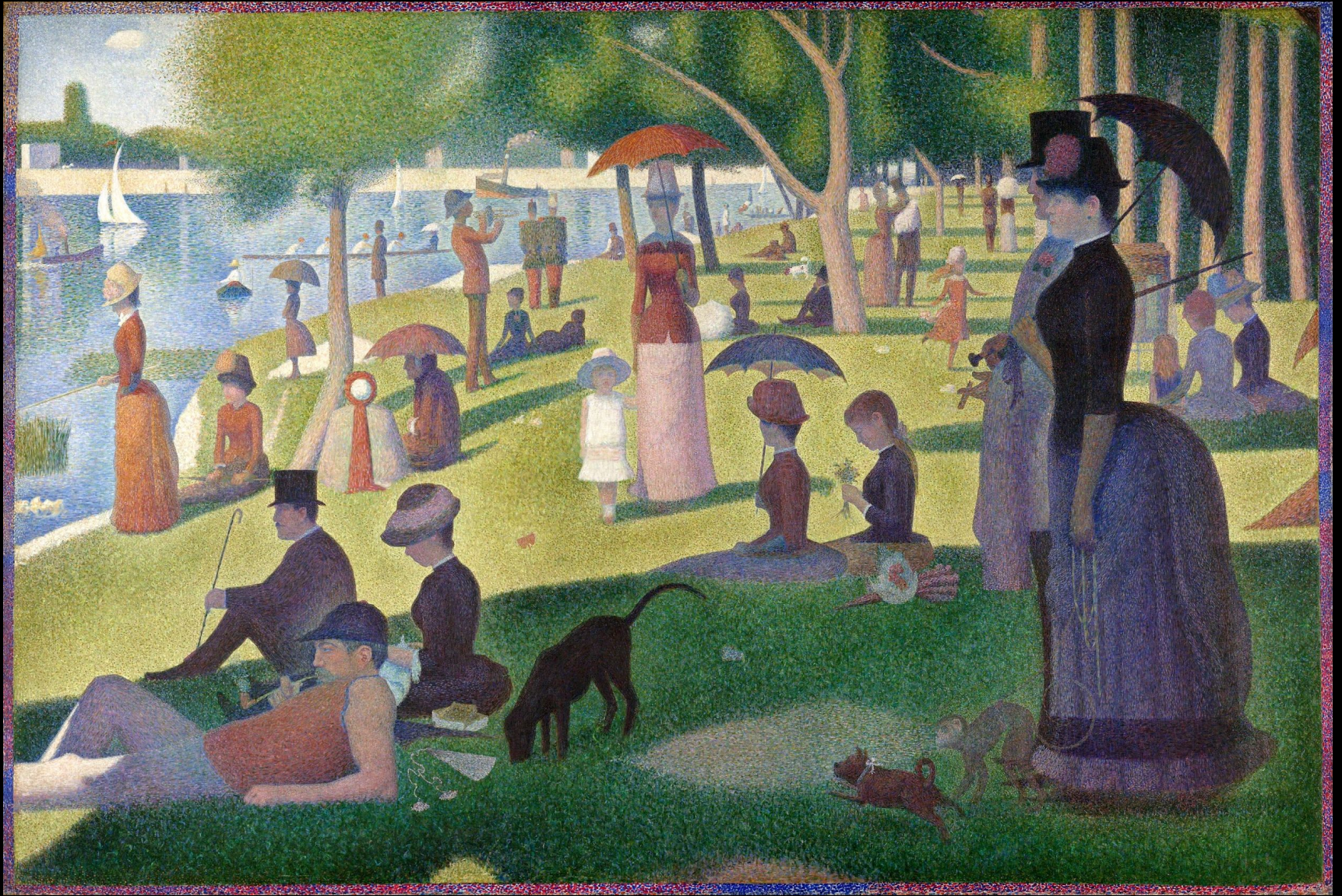
George Seurat, Sunday Afternoon on the Island of La Grande Jatte, 1884-86