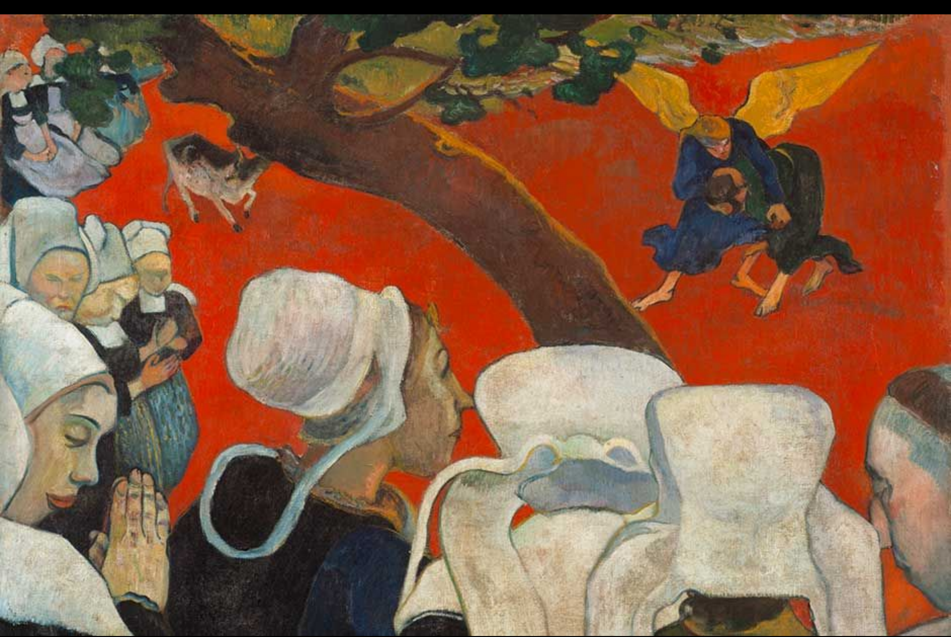
Gauguin, Vision After the Sermon (Jacob Wrestling with the Angel), 1888