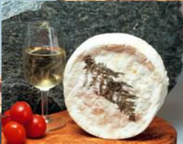
Coeur de Chevre