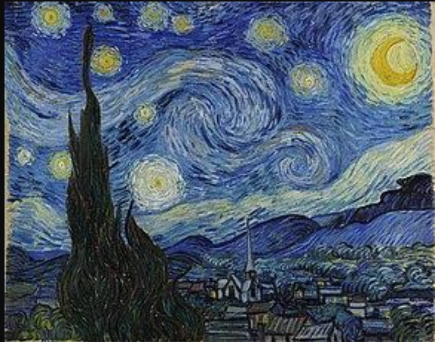
The Starry Night