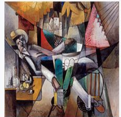
Albert Gleizes, L'Homme au Hamac (Man in a Hammock) , 1913, oil on canvas, 130 x 155.5 cm