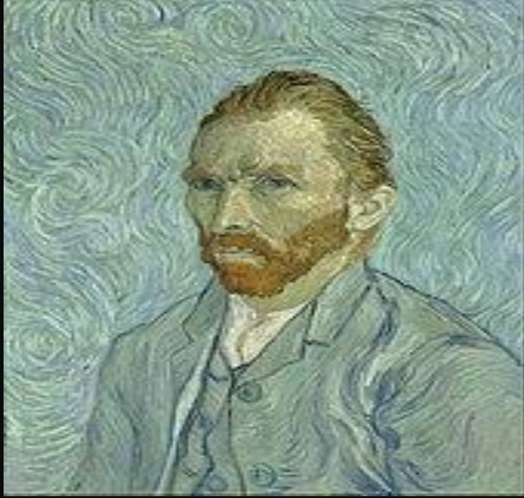
Self-Portrait, September 1889.