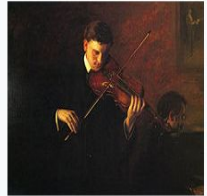
Thomas Eakins, Music , 1904