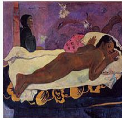
Paul Gauguin, Spirit of the Dead Watching 1892