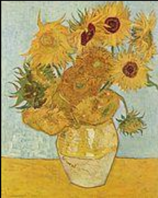
Vase with Twelve Sunflowers