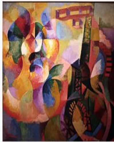
Robert Delaunay, Soleil, Tour, Aéroplane (Sun, Tower, Airplane) , 1913