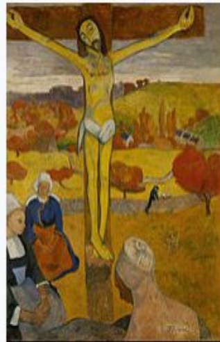
Paul Gauguin, The Yellow Christ , 1889