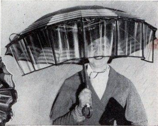
Umbrella with transparent shield in place for use in a driving rain. The photograph at the left shows how the sections fold inside the cover when not in use

tion when in use. The device was invented by a Brooklyn, N. Y., woman who had been struck by an auto that she failed to see because an ordinary umbrella obscured her view during a rain storm.