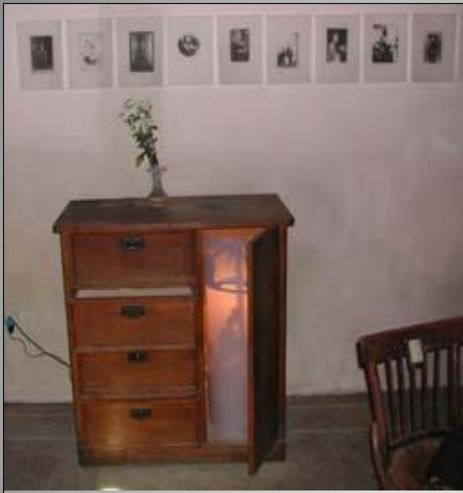
Комод, где рождались картины первой пьесы Булгакова.