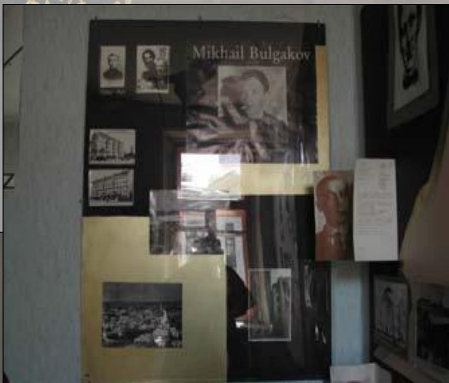
Стенды, посвященные биографии и драматургии Булгакова.