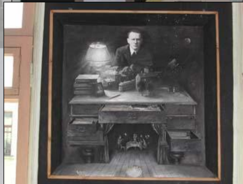
Стенд в первой комнате музея.