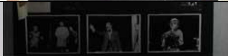
Стенд в первой комнате музея.