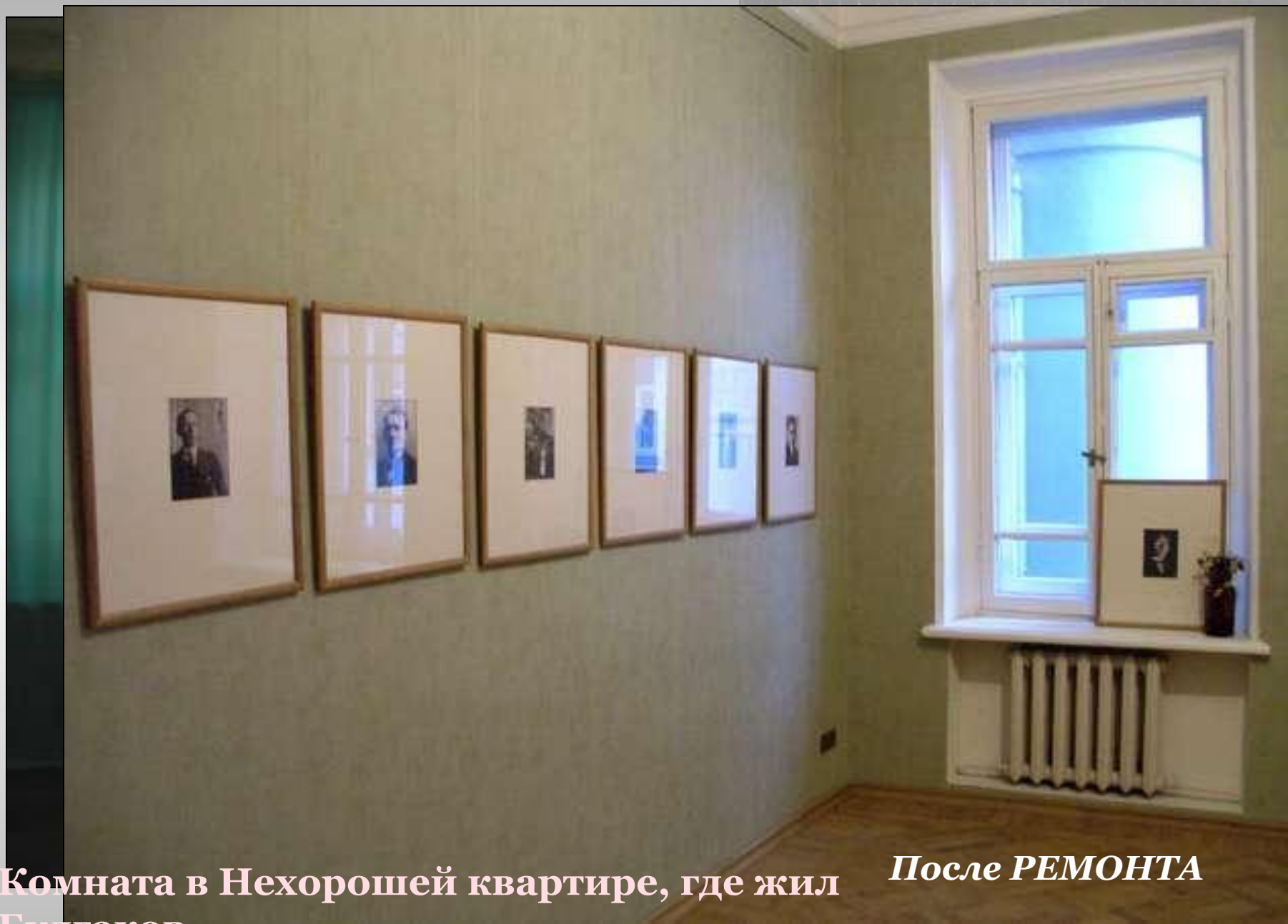
Комната в Нехорошей квартире, где жил Булгаков.