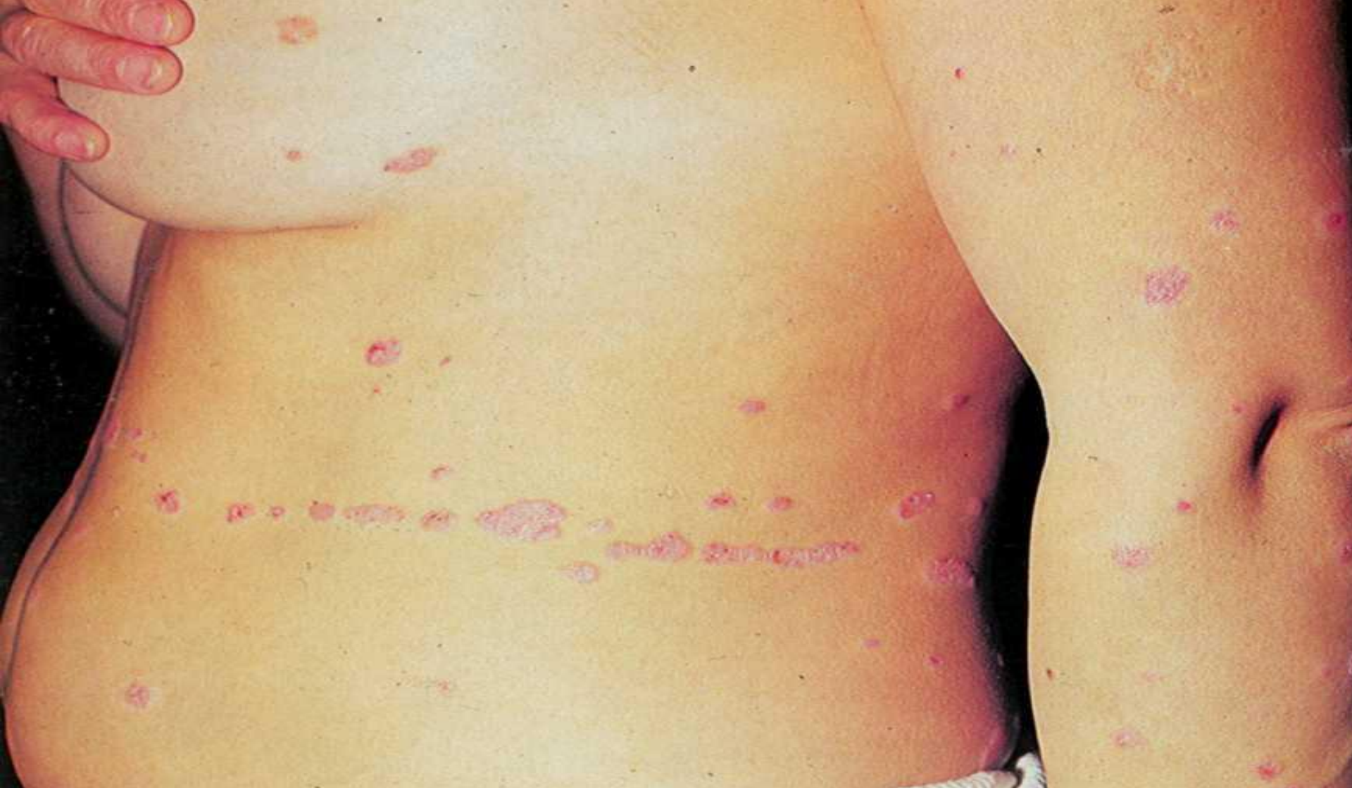
Psoriasis vulgaris (phaenomena isomorphe Kobner)