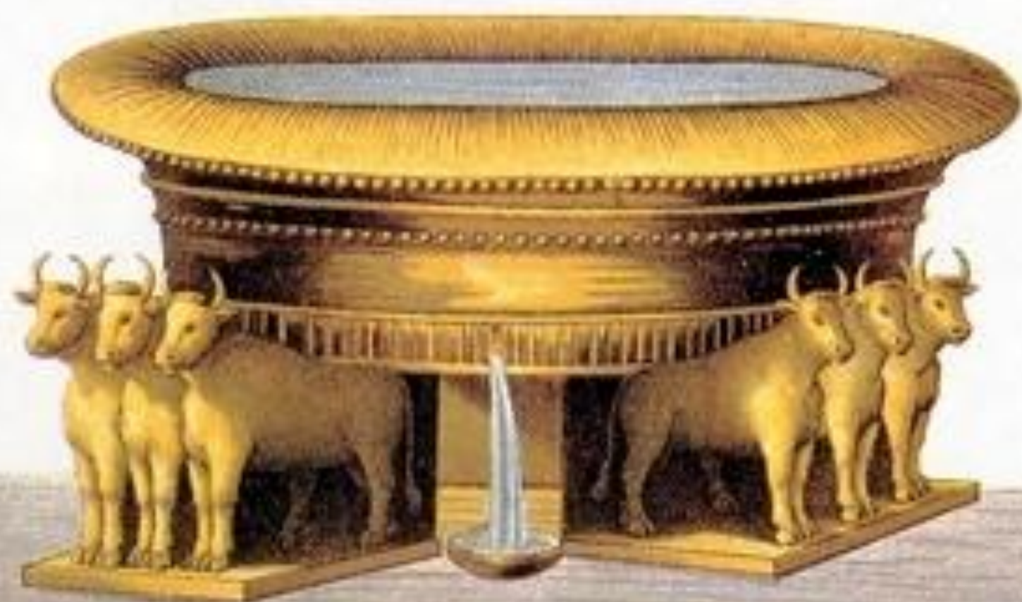
Мѣдное море храма Соломона.