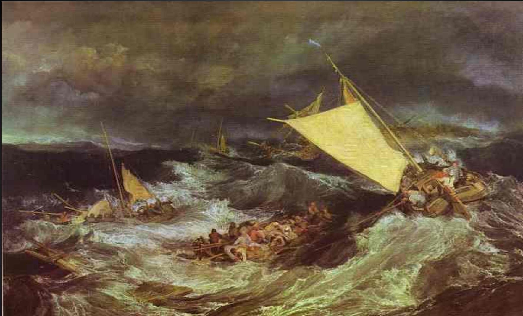
The Shipwreck. 1805. Oil on canvas. Tate Gallery, London, UK.