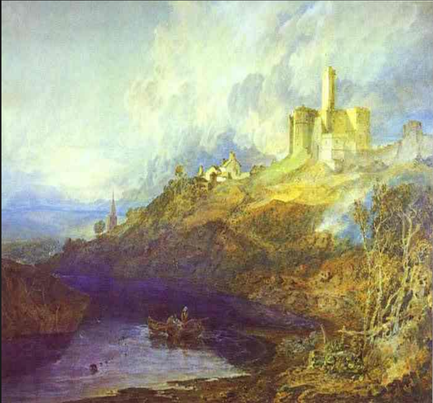
Warkworth Castle, Northumberland - Thunder Storm Approaching at Sun-Set. 1799. Victoria and Albert Museum, London, UK.