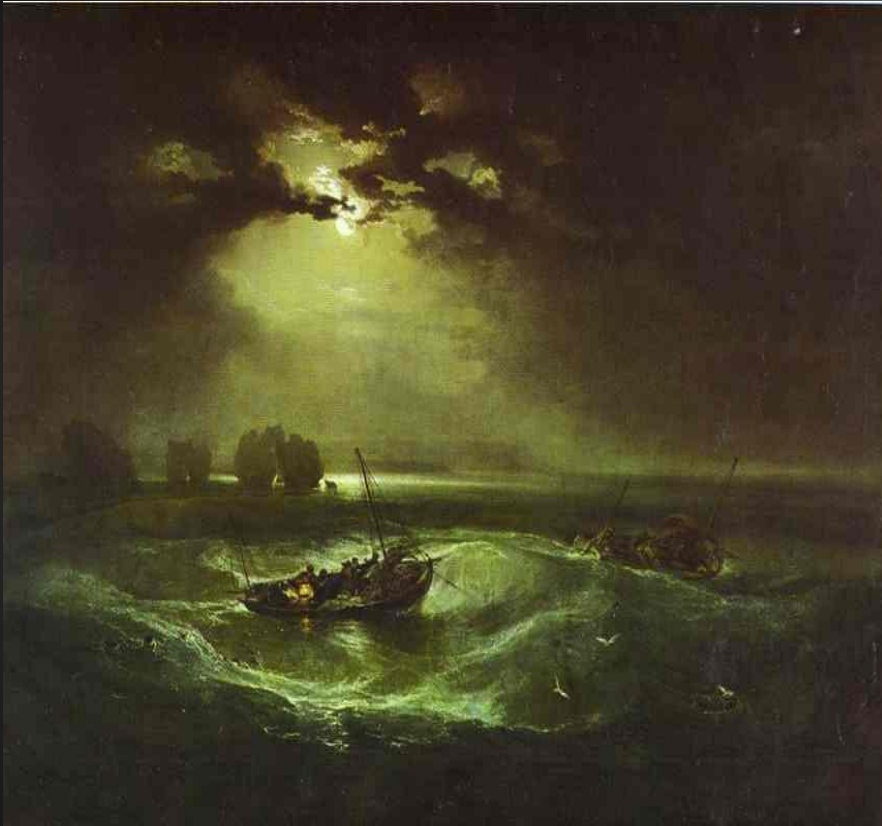
Fishermen at Sea. 1796. Oil on canvas. Tate Gallery, London, UK.