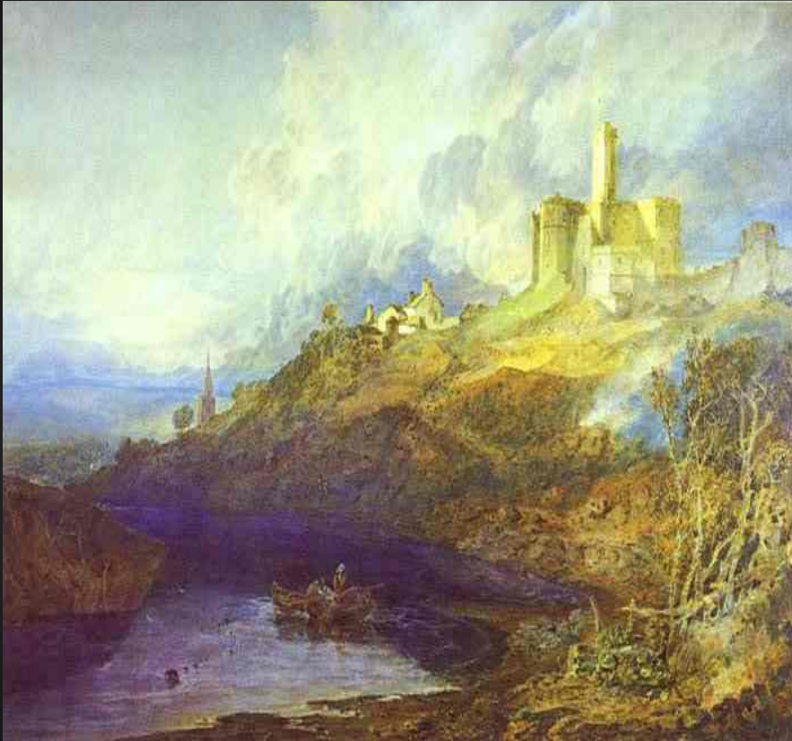
Warkworth Castle, Northumberland - Thunder Storm Approaching at Sun-Set. 1799. Victoria and Albert Museum, London, UK.