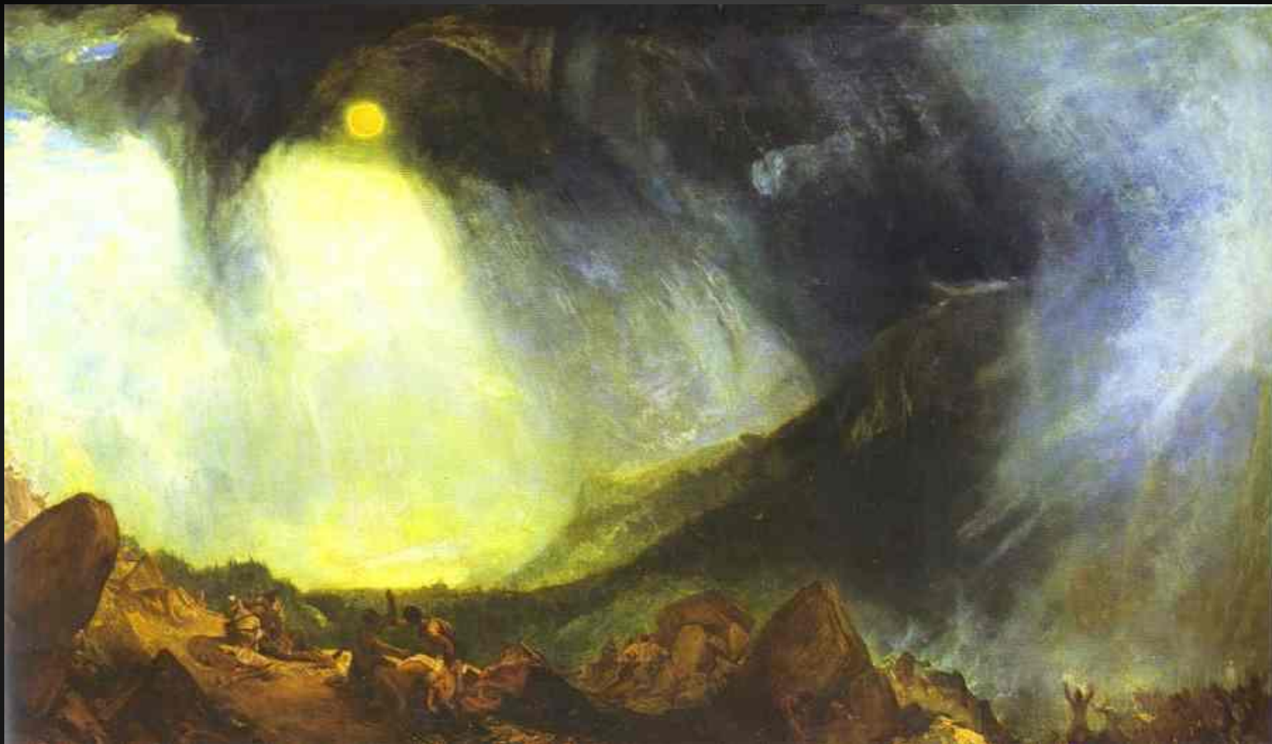
Snow Storm: Hannibal and His Army Crossing the Alps. 1812. Oil on canvas. Tate Gallery, London, UK.