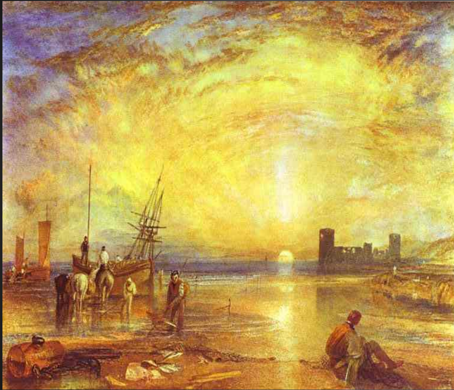
Flint Castle. 1838. Watercolour on paper. Private collection, Japan.