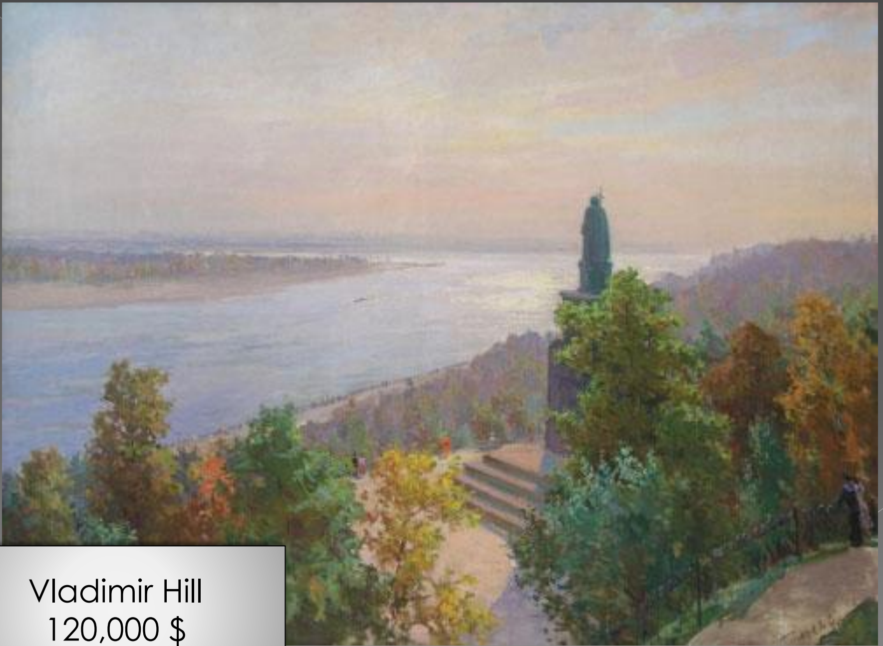
Vladimir Hill 120,000 $