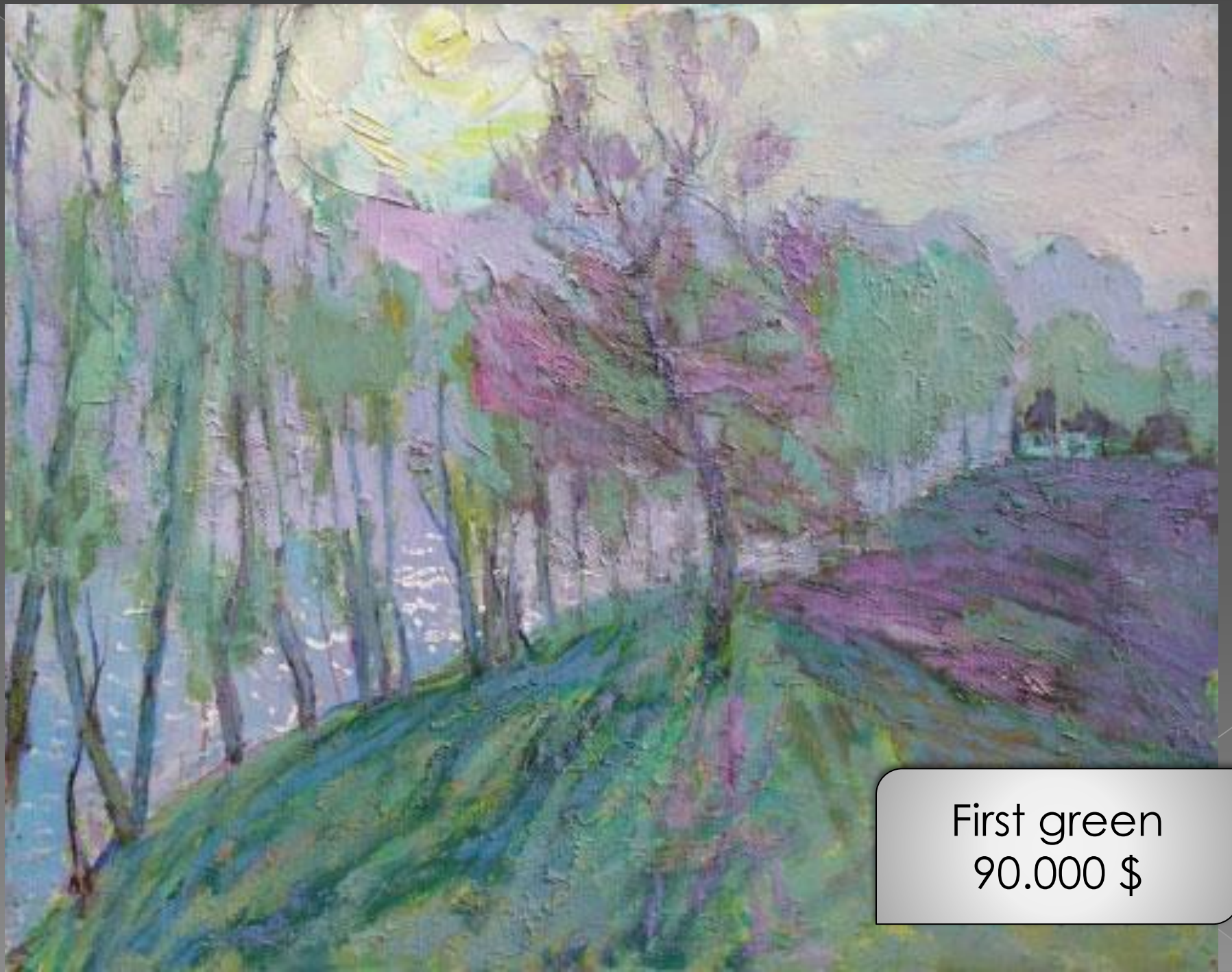
First green 90.000 $