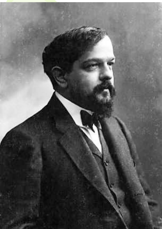
Клод Дебюсси 1862-1918