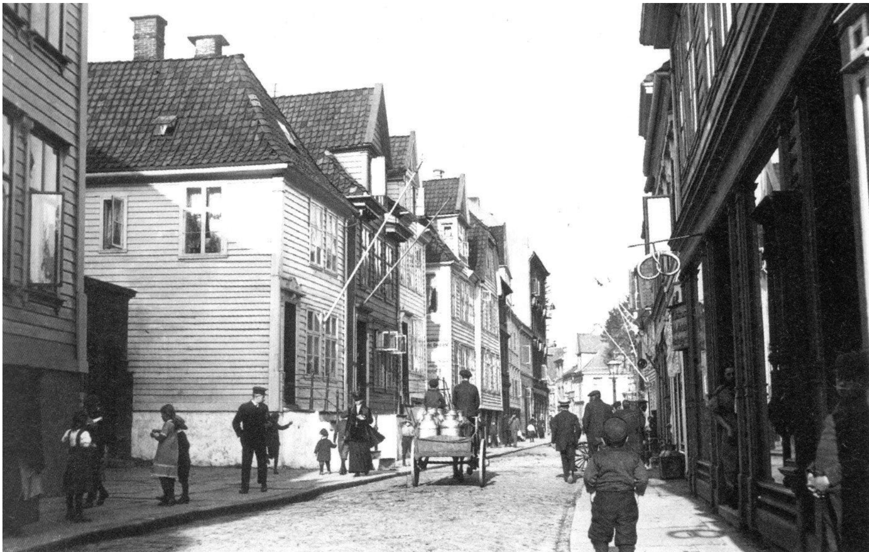
Берген, ул. Страндгатен конец 19 века