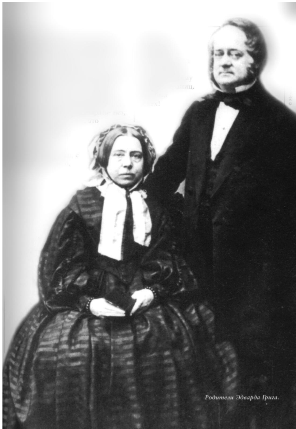
Родители Эдварда Грига.