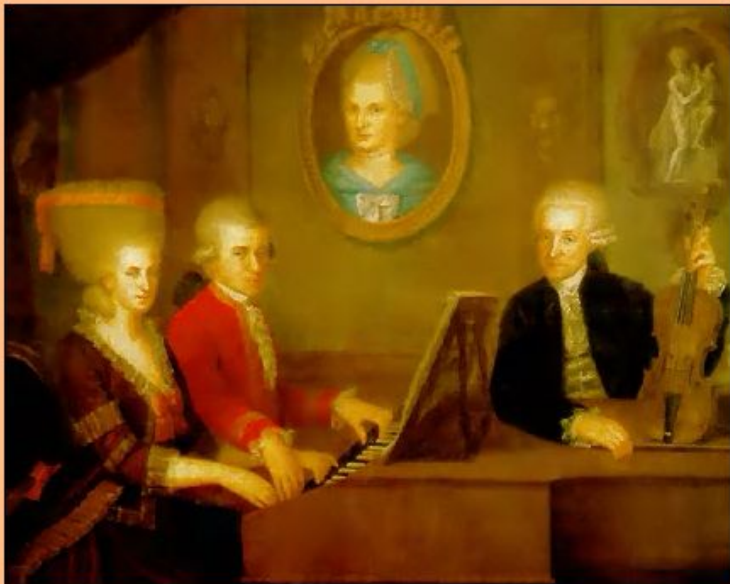
Семья Моцартов: юный Вольфганг Амадей с отцом и сестрой