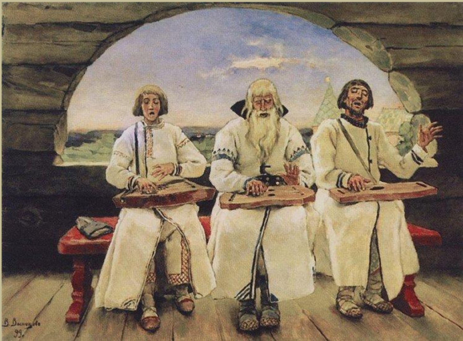
«Гусляры» В.М. Васнецов