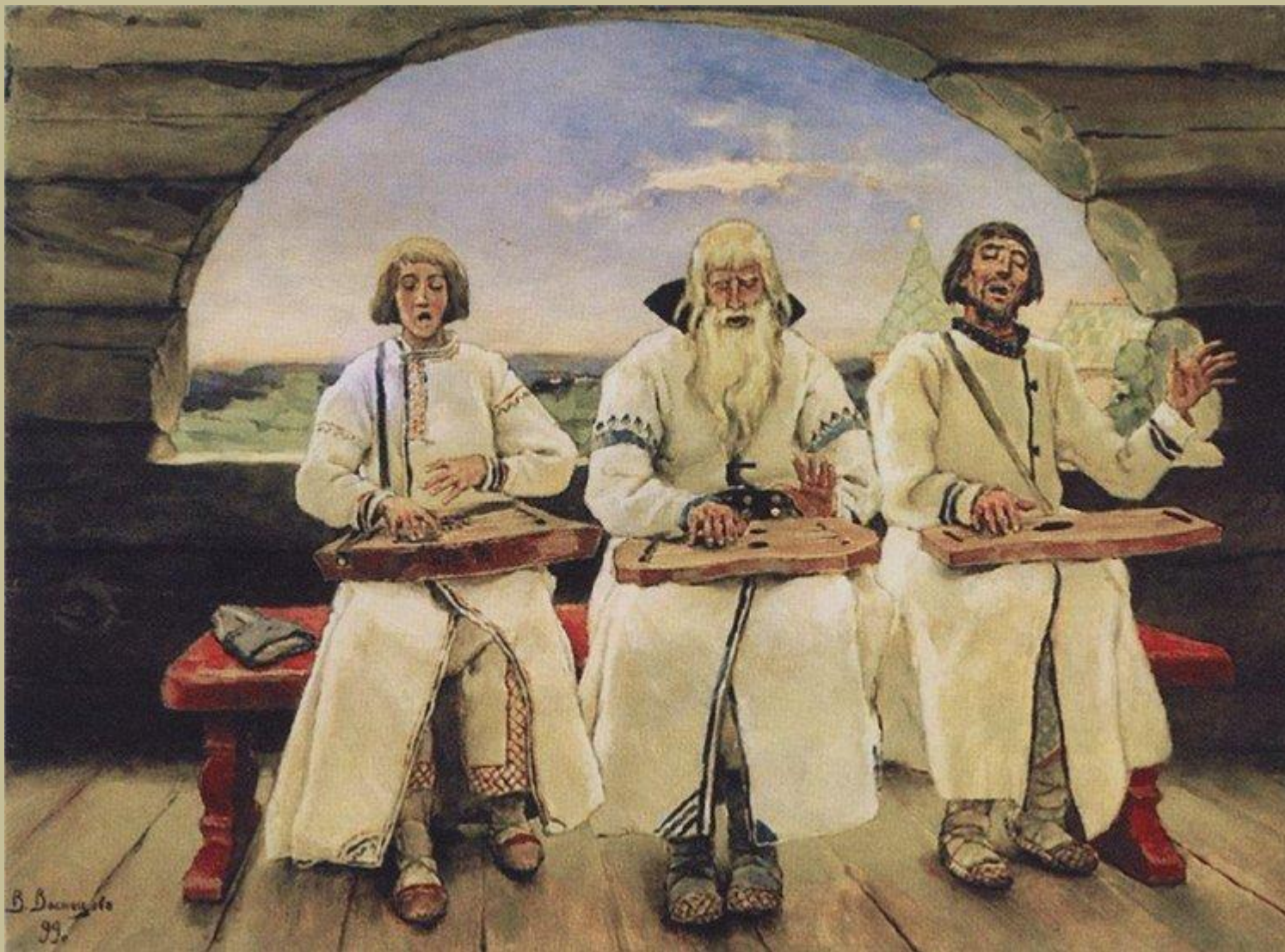
«Гусляры» В.М. Васнецов