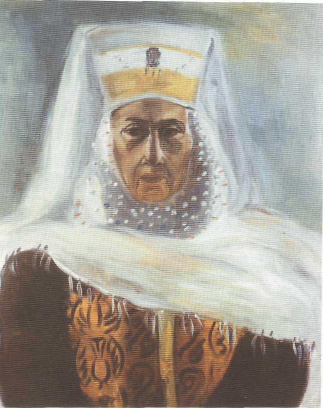
Mother Of Abai - Ulzhan