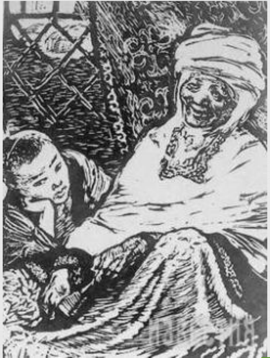
Abai grandmother Zere