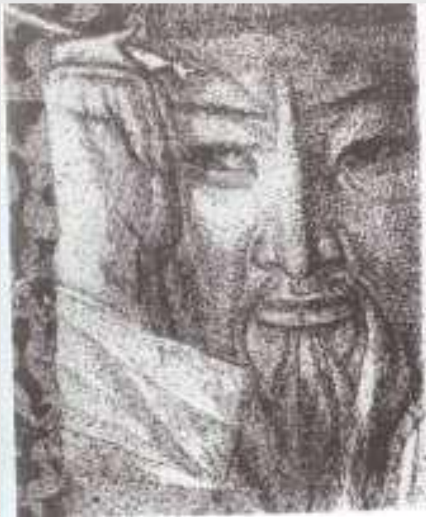
Illustration for the novel by M. Auezov «Abai's Path»