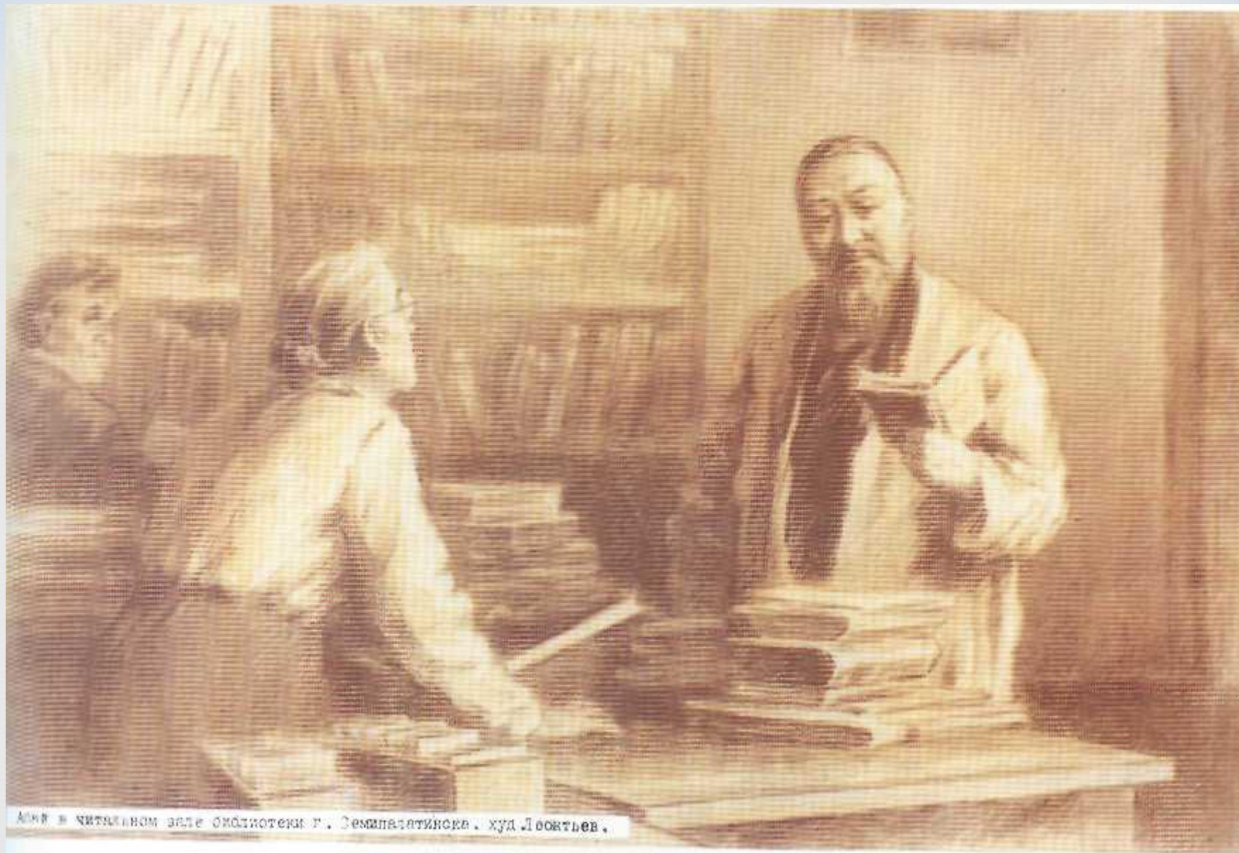
Абай в читальном зале библиотеки г. Семипалатинска. худ. Лоскутьев.

Abai Kunanbayev in Semipalatinsk library