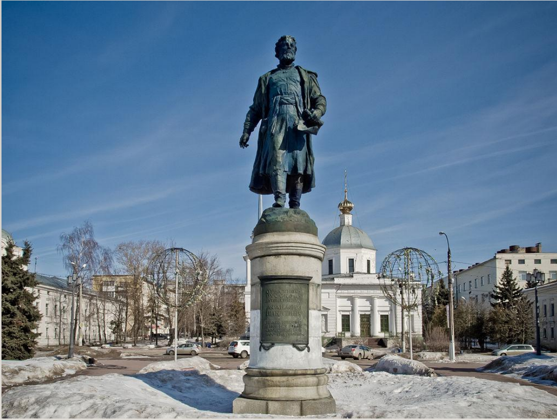
Statue in Tver