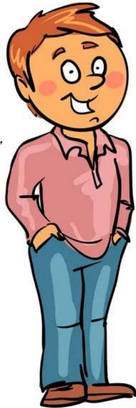
dad daddy father