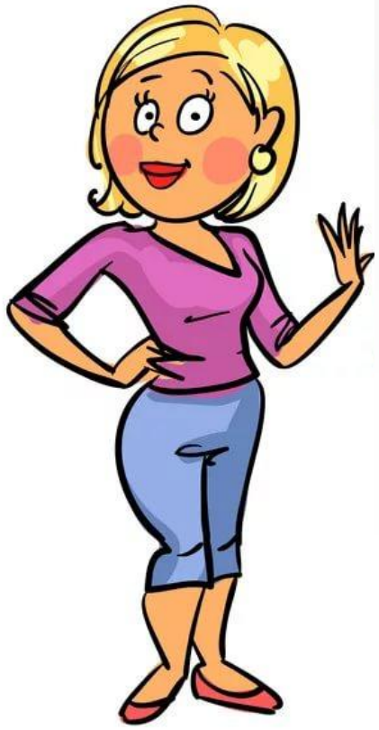
mum mummy mother