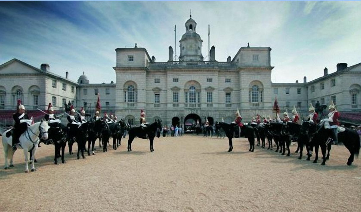
the museum of a cavalry