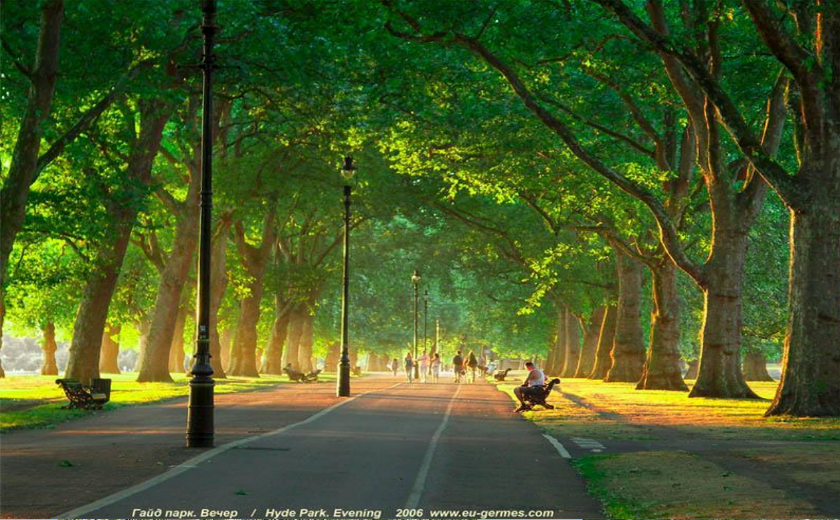
Гайд парк. Вечер / Hyde Park. Evening 2006