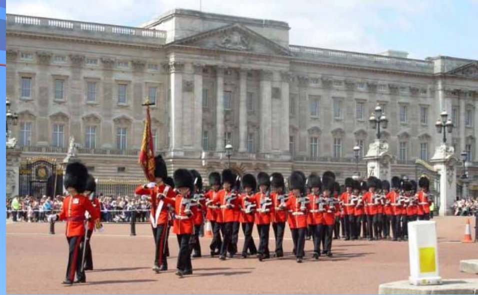
museum of guard