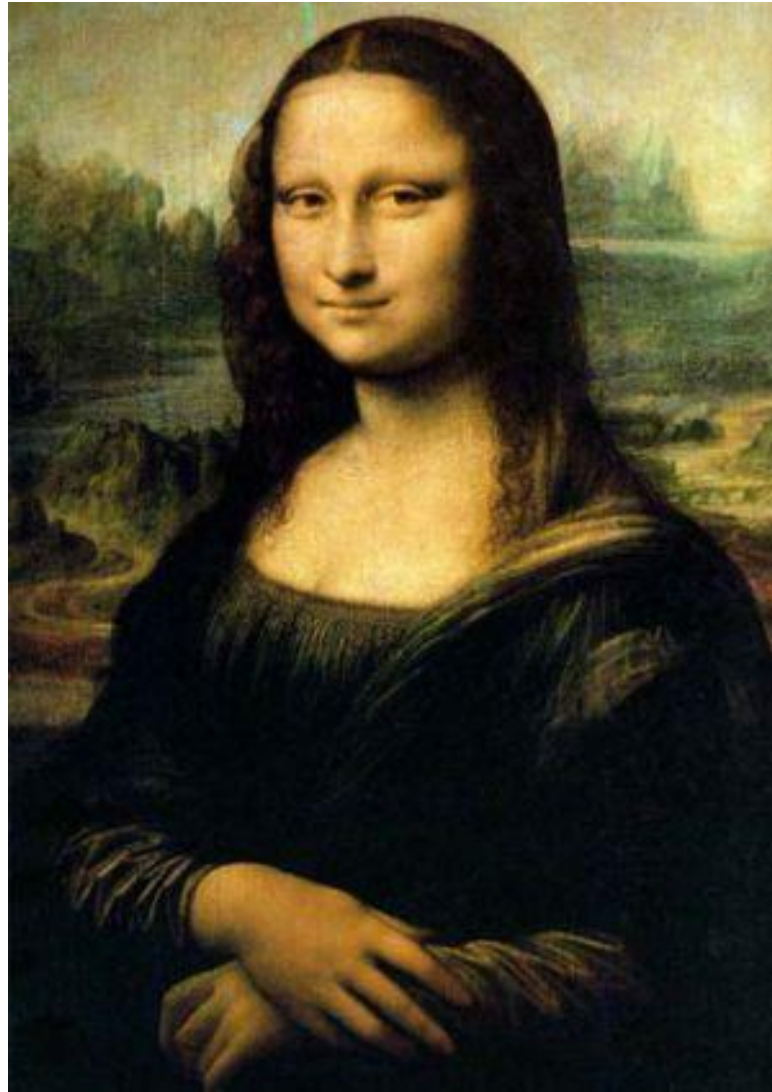
Mona Lisa (Giocondo ) 1503-1505