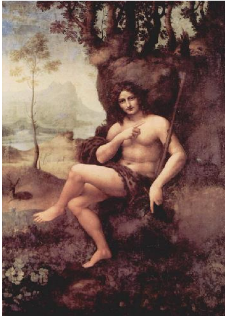
St. John (Bacchus) 1511- 1515