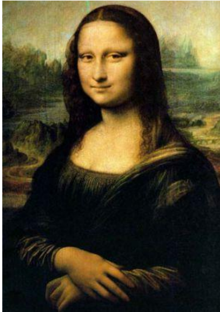
Mona Lisa (Giocondo ) 1503-1505