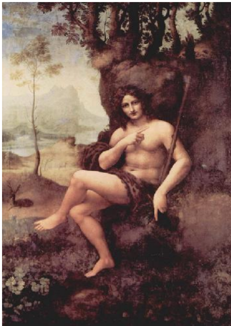
St. John (Bacchus) 1511- 1515