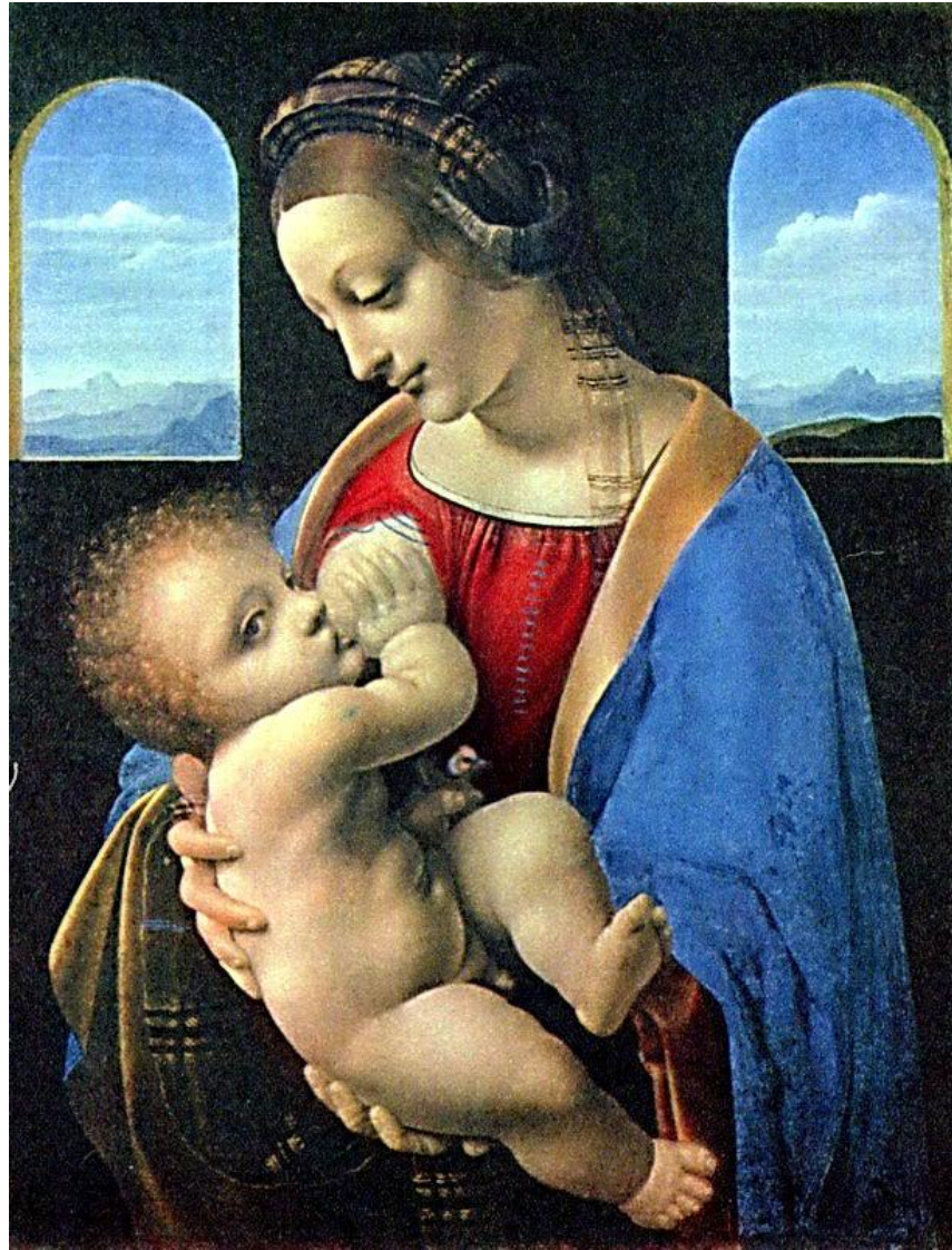
«Madonna Litta» near 1490