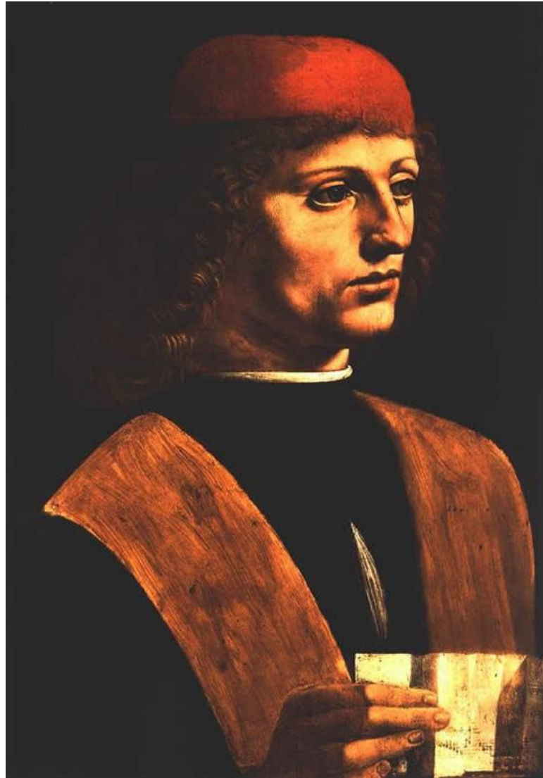
Ritratto di musico 1490