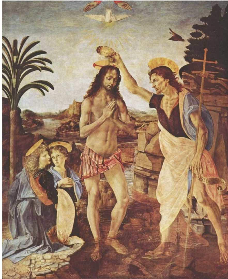
Baptism of Christ 1472-1475