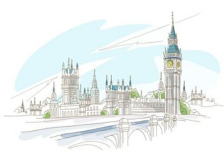
The Houses of Parliament