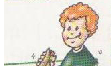
eat a hot dog