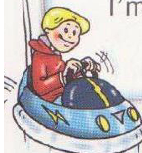
drive a car