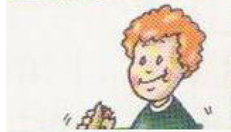
eat a hot dog