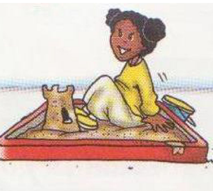
make a sandcastle