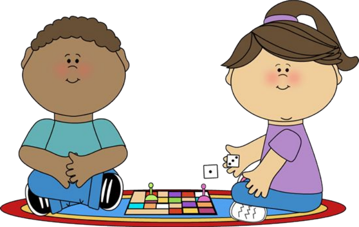
play a game