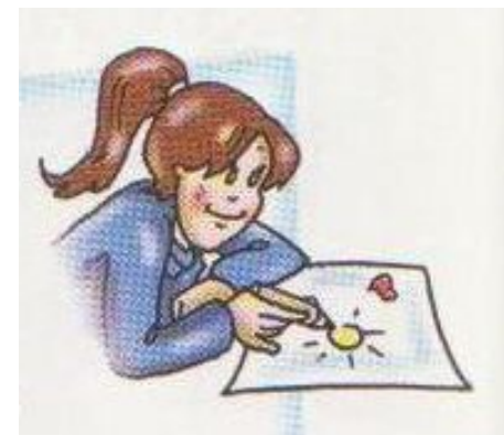
paint a picture