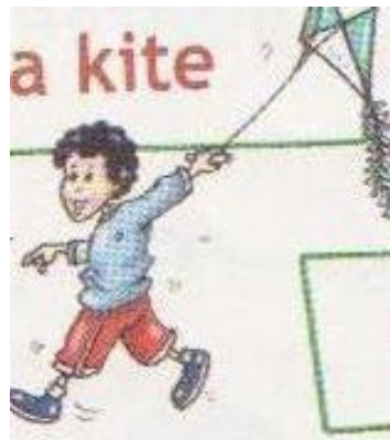
fly a kite