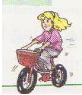
ride a bike