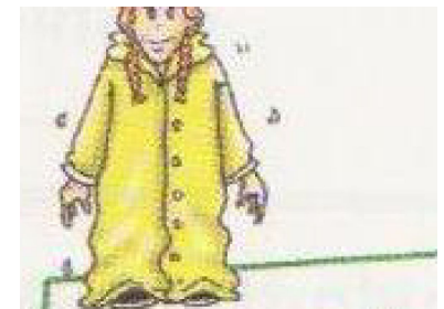
wear a mac