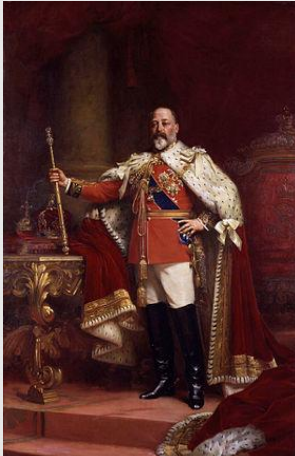
King Edward VII