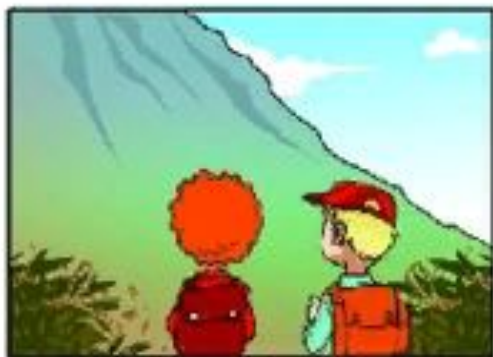
go to the mountain