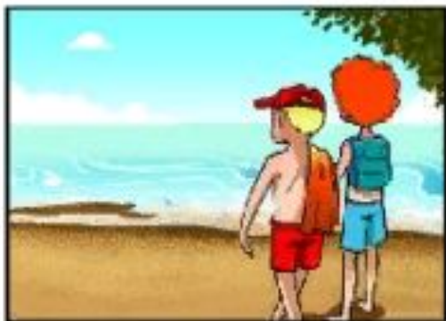
go to the seaside