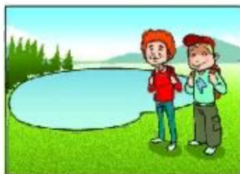
go to the lake