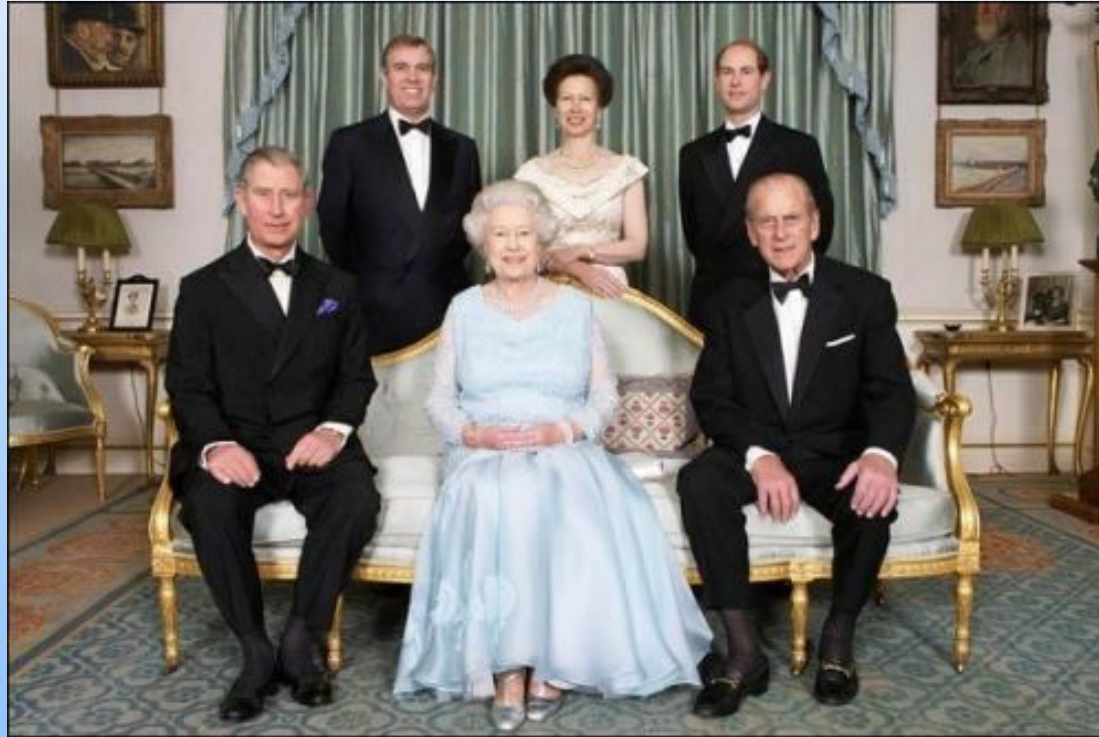
Queen Elizabeth II , Prince Philip, Duke of Edinburgh (right), Charles, the eldest son( left), Andrew, Anne and Edward.